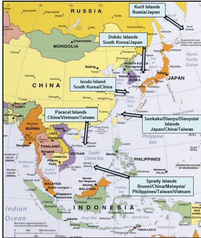
Fig. 1. Maritime disputes in the East Asia and Pacific.