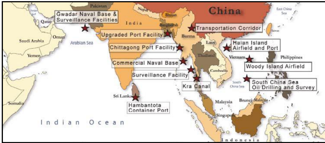
Fig. 3. Location of selected facilities with Chinese capital along Asian south coastline.