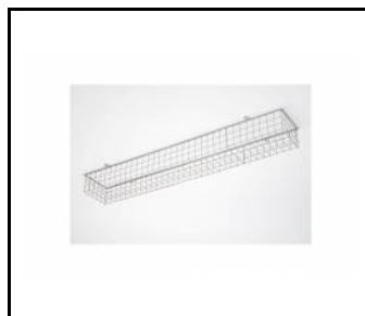
TYTAN LED. ATLAS LED - protective grid 1432mm (907920)