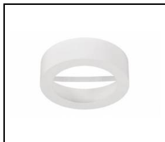
Round surface casing - white. 15W (059858)