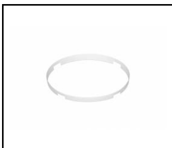
Ceiling ring Dione LED steel 1.5 white matt RAL 9003 painted vandal resistant (120DL118)