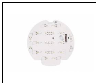
CORAL- 10W service kit 10W RCR 3000K (229848)