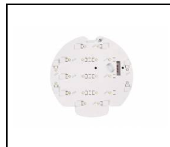
CORAL- 10W service kit 10W RCR 4000K (229787)