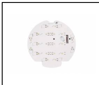
CORAL- 10W service kit 10W 3000K (229831)