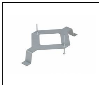
CORAL - flush-mounting support (229763)