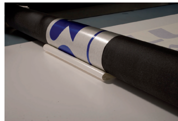
Fast and precise dry application to surface.