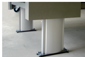
Even better ergonomics if you choose a height-adjustable ROLLROLLER®.