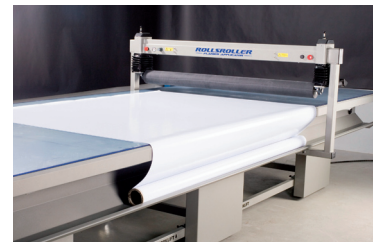
Practical side pockets for textile media.