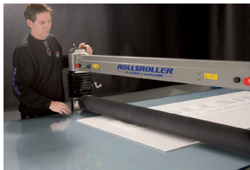
Ergonomic working height.