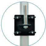
Bracket to attach a Zoom+ flag (optional) ZT-FCB