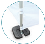
Tent weight (optional) ZT-BASE