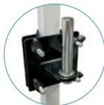
Bracket to attach a Zoom+ flag (optional) ZT-FCB