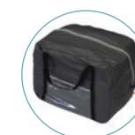
Carry bag included