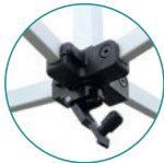
Crank to tighten the canopy