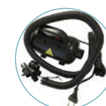
400W electric pump (optional) INFTA-PE4EU