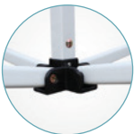
Winder for opening and closing