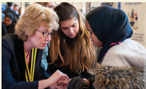
Our craft is as relevant now as it was in 1629: a Liveryman explains contact lenses to schoolchildren

You do not have to be working within the world of optics to join the Company. Up to 25 per cent of the members of the Company come from other professions or occupations. The Clerk encourages applications for membership and questions from anyone who may be interested in joining. Call 020 7236 2932 or email clerk@spectaclemakers.com