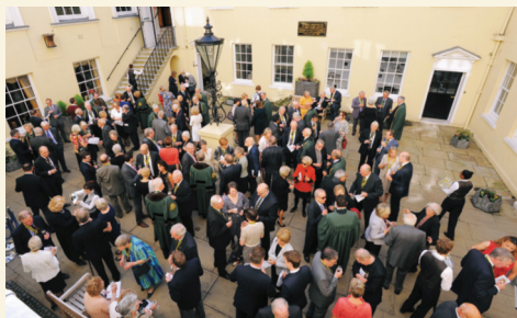
Members enjoy a drink before lunch in the historic courtyard at Apothecaries' Hall

1670, just after the Great Fire of London. The annual Livery Dinner is held in one of the larger Livery Halls in the City, some of which are not generally open to the public.