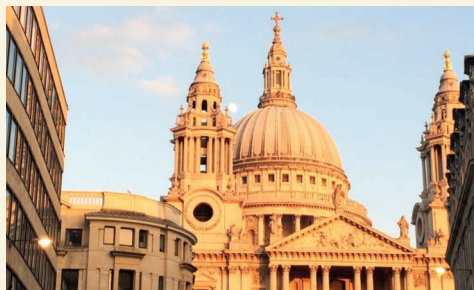
WCSM is ranked 60th in the order of precedence of Livery Companies in the City of London