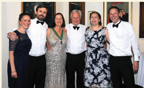
All Freeman and Liverymen are members of The Spectacle Makers' Society which organises social events throughout the year