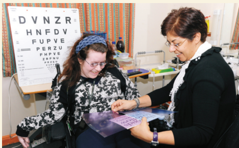
In the UK, a Visual Impairment Adviser supported by our Charity helps students improve their quality of life

It is also possible to join the Company by right of patrimony, if one of your parents was a Liveryman of the Company at the date of your birth. Other applicants are welcomed - the only requirement being that their application must be proposed and seconded by two Liverymen of the Company.