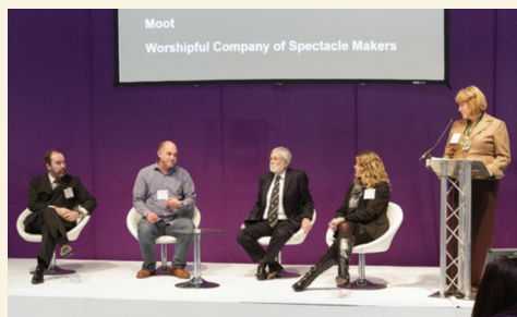
Liverymen who are leaders in their field discuss developments in treating visual impairment