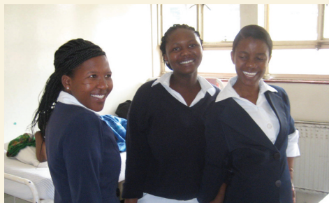
Ophthalmic nurses at the University in Maseru, Lesotho celebrate passing their course, funded by The Spectacle Makers' Charity