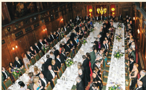
Events range from formal dinners to weekends away, in the UK and further afield