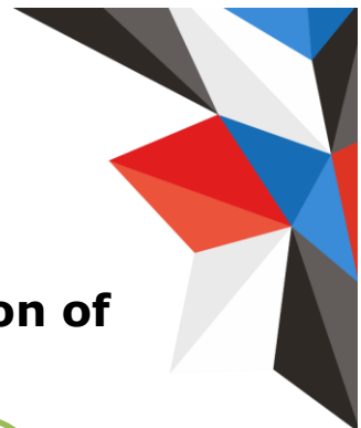
Distribution of projects by the end date