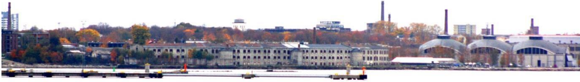
2. View from the roof of Linnahall (Tallinn City Hall)