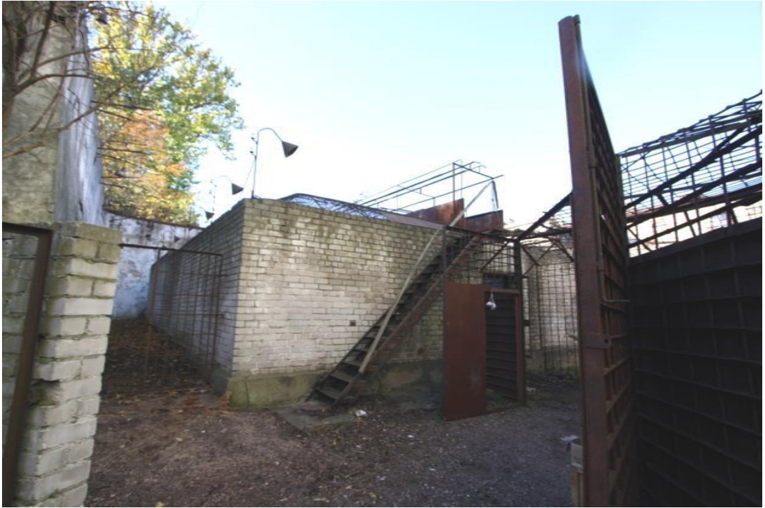
47. Prisoners' walking complex, inner corridor