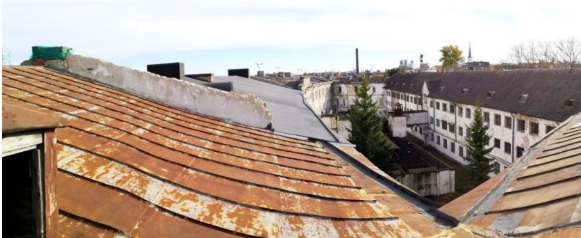
5. View from the east, individual chamber building in the foreground