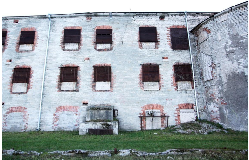
24. Seaward façade of the middle half-tower of the gorge building, view from east