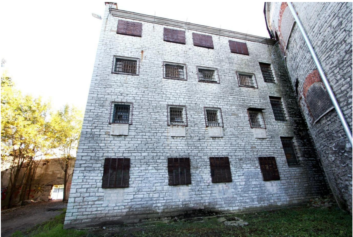
10. 2 nd floor windows of the north-eastern façade of the individual chamber building