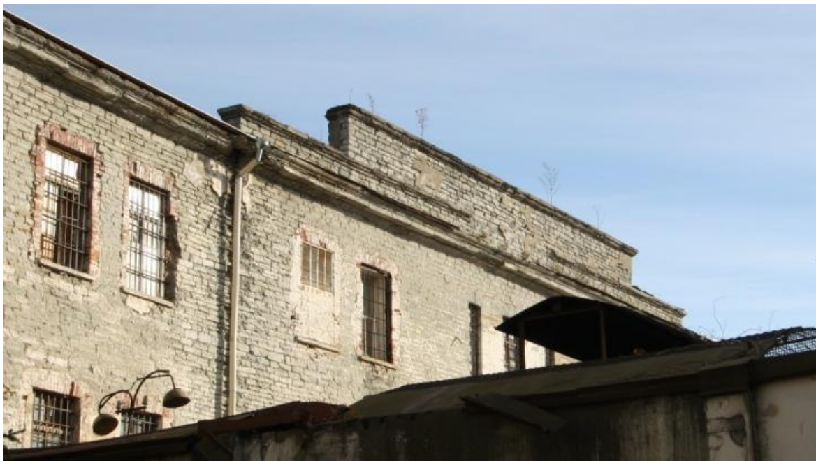
34. The gate of the prison, view from the north