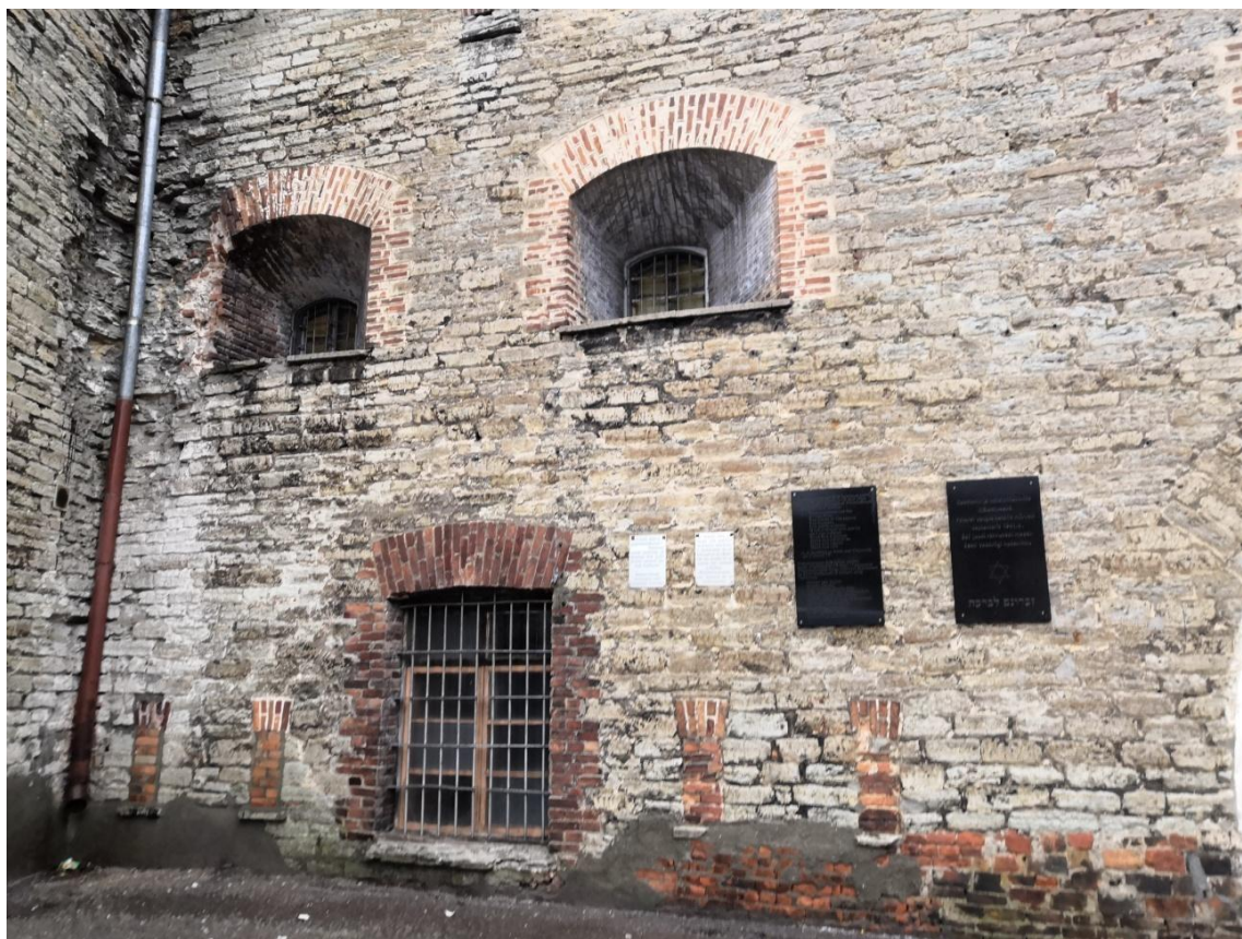
54. Interface of the lunette and the eastern wing of the gorge