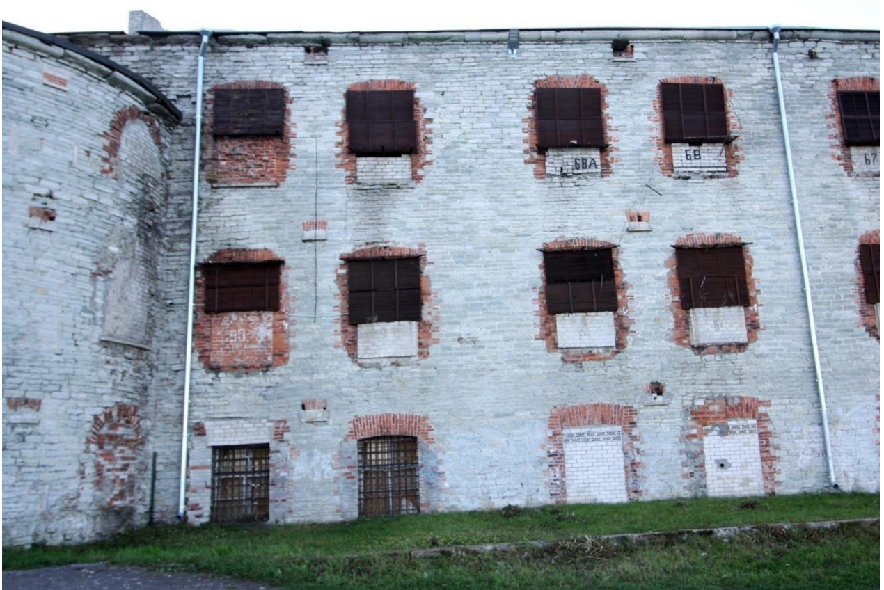
22. Sector 2 in the eastern wing of the gorge building, seaward façade