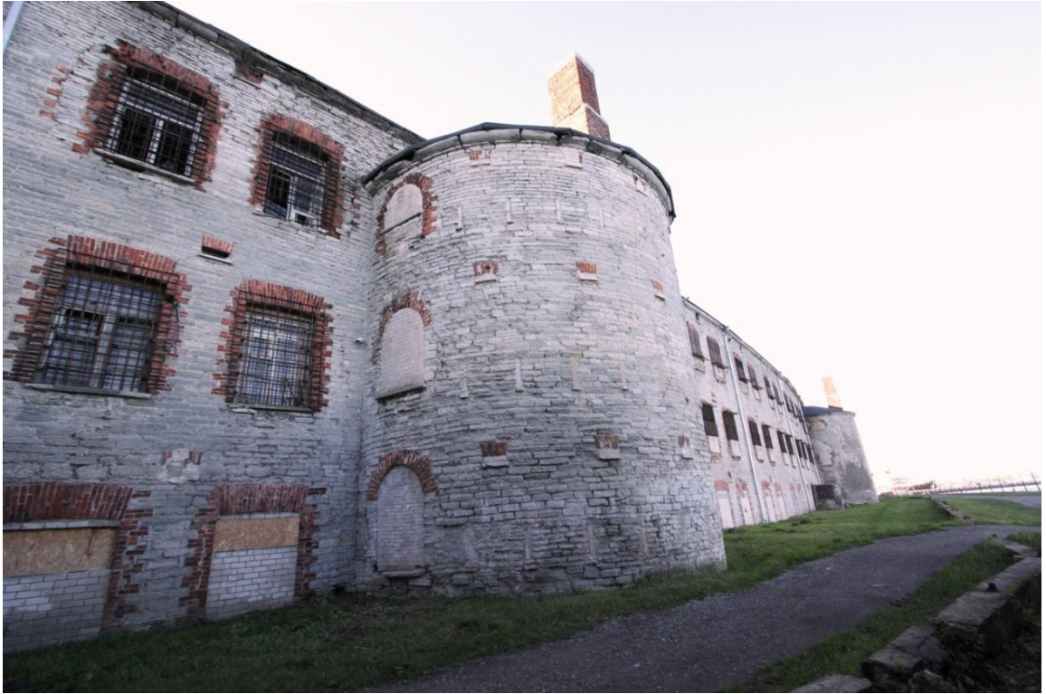
18. Half-tower in the eastern wing of the gorge, seaward façade. Bricked-up gun ports and smoke channels, curved bricked-up windows on sides of all three floors.