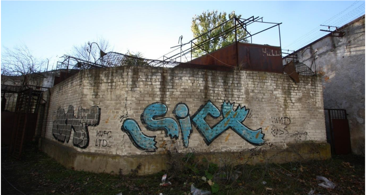
45. Limited open-air corridor covered with the metal grille between the prisoners' walking boxes and the end of the eastern wing of the gorge, view from the west