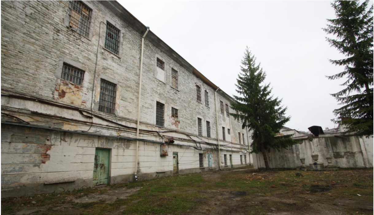
27. The façade of the gorge courtyard, interface of the eastern wing of the gorge and lunette wing, 27.1. photo 2. and 3 rd floor, 27.2. photo 1 st floor