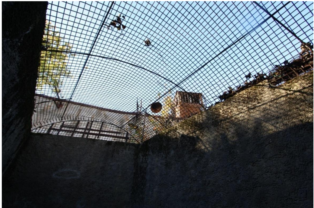
50. Prisoners' walking complex, net covers of the walking cells, prison guard's observation deck railings on the right