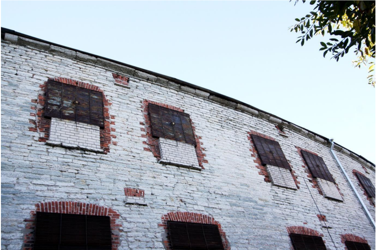
14. Sector 1 in the eastern wing of the gorge building, seaward façade