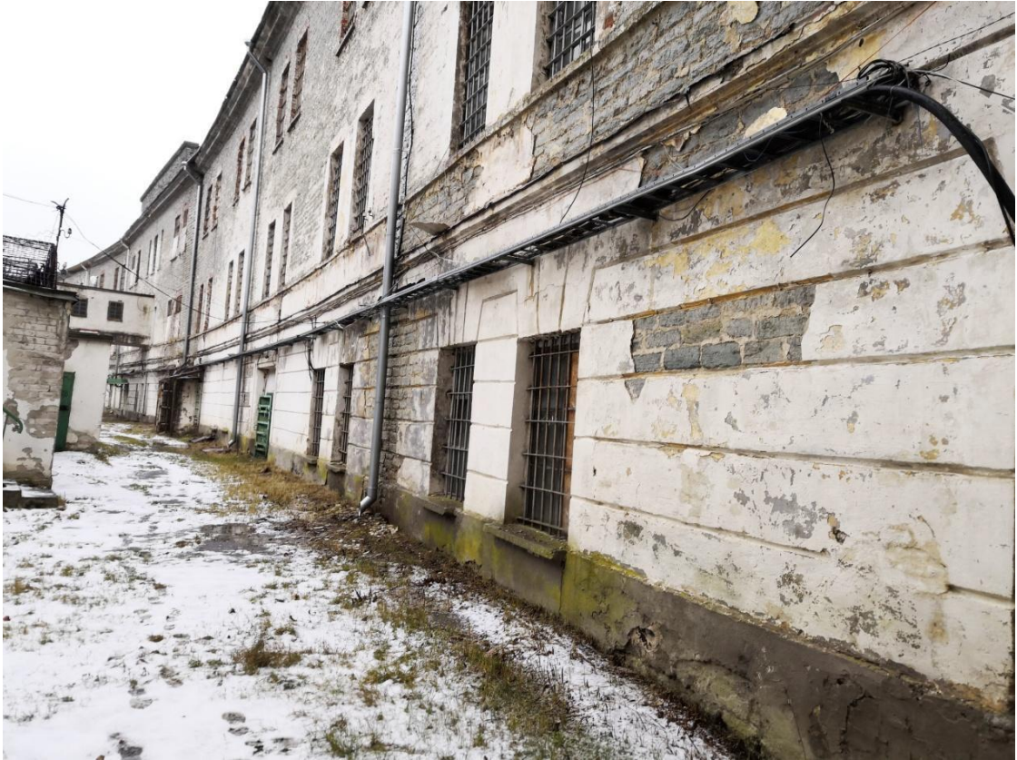
30. Sector 2 in the eastern wing of the gorge, façade of the gorge courtyard, view from the southeast