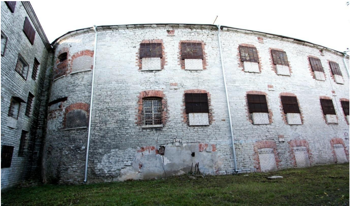
12. Sector 1 in the eastern wing of the gorge building, 1 st and 2 nd floor windows