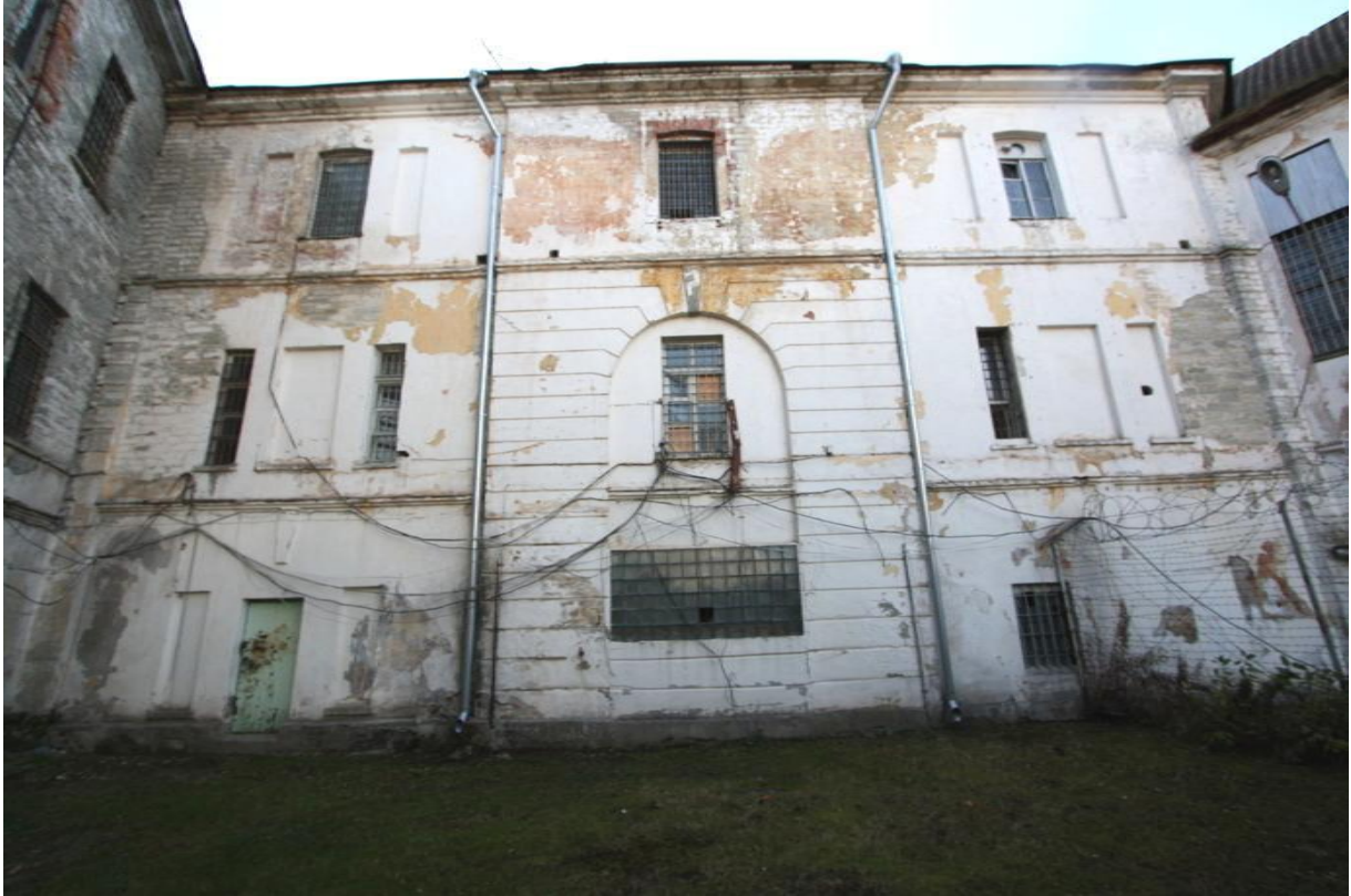
52. Southern façade of the lunette