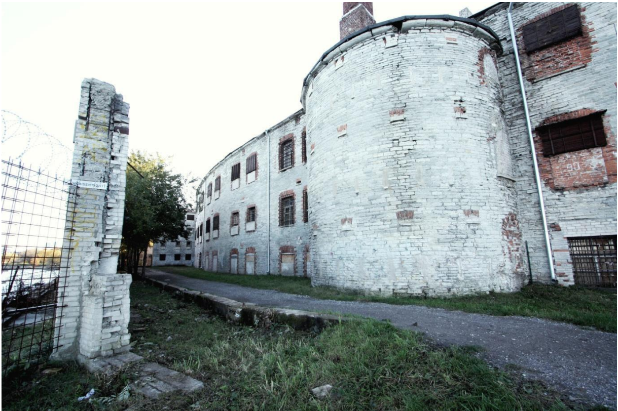
20. Sector 2 in the eastern wing of the gorge building, seaward façade