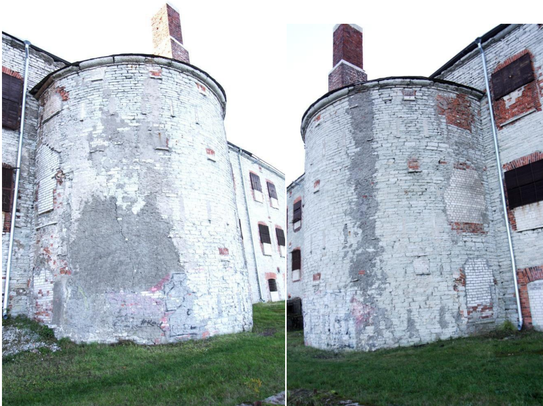
25. Seaward façade of the middle half-tower of the gorge building, view from north-east