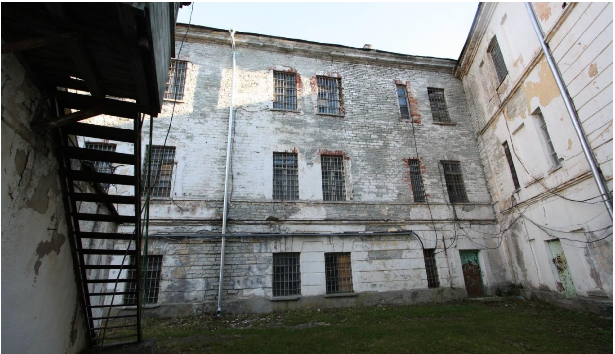
28. Eastern wing of the gorge, juncture of 1 st and 2 nd sector, façade of the gorge courtyard