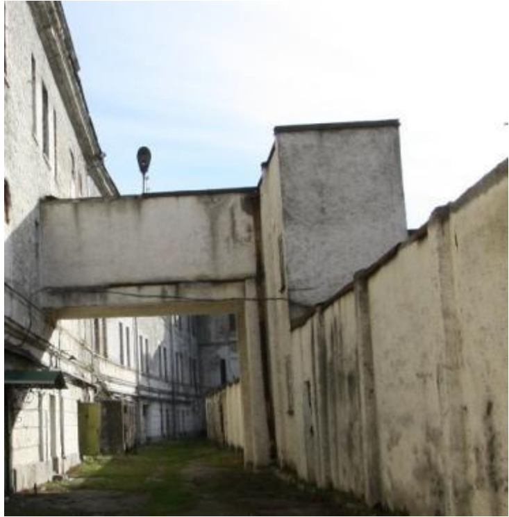
32. Façade of the gorge courtyard of sector 2 of the eastern wing of the gorge, first floor, door to the church