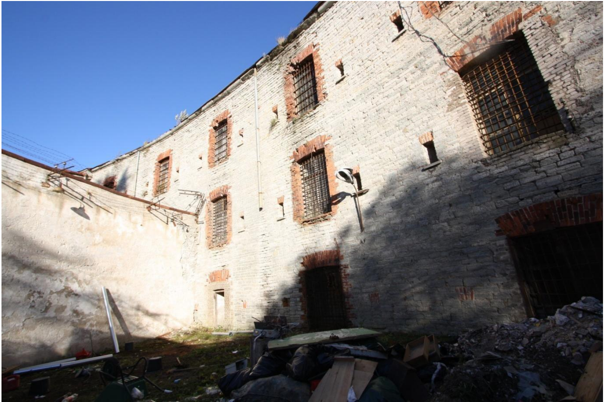
40. Curved end façade of the eastern wing of the gorge, on the 3 rd floor two preserved bricked-up embrasures and lintel of the smoke channel over a later window. Megaphone on the window.