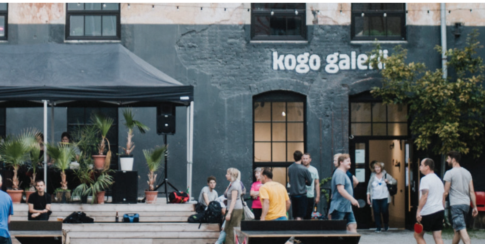
Aparaaditehas. Culture Factory, Tartu https://www.aparaaditehas.ee/en