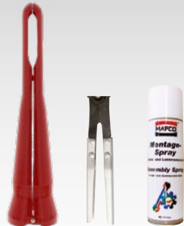
Universal boot kits with installation tools Product group 18