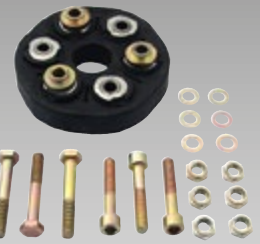
Propshaft joints Product group 77