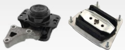
Engine mountings/Gearbox mountings Product group 37