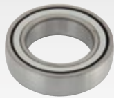
Intermediate bearings for drive shafts Product group 77