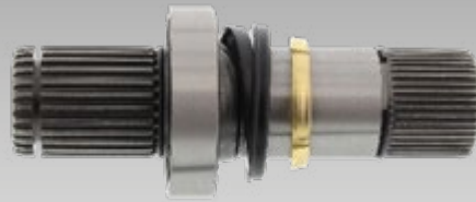
Stub axle for differentials Product group 77