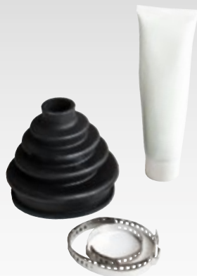
Vehicle specific axle boot kits Product group 18