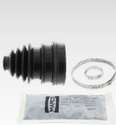
Universal boot kits Product group 18