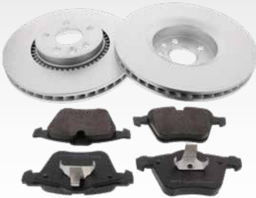
Disc brake kit: Brake rotors and pads (some HPS-parts) Product group 47