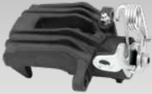
Brake calipers Product group 04