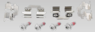
Brake shoe accessory kits Product group 09