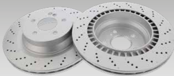
Brake discs Product group 15