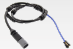
Wear indicators for brake pads Product group 56