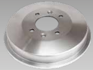
Brake drums Product group 35