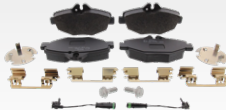
Brake pads Product group 06