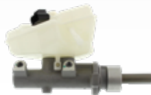
Brake master cylinders Product group 01