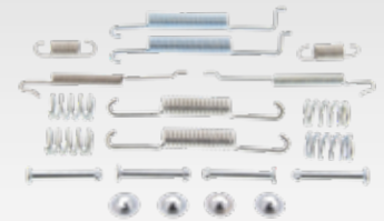
Brake shoe accessory kits Product group 09