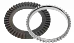
ABS rings Product group 76