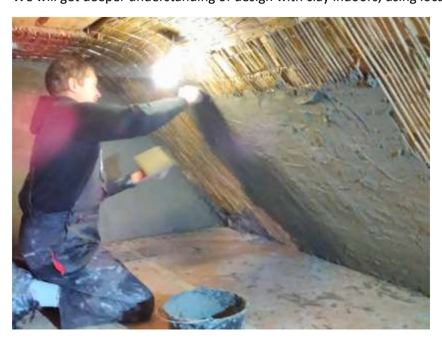
*Second floor of wooden sauna house, where we work with finishing coats of clay plasters.

We will get deeper understanding of design with clay indoors, using local clay and fibres.