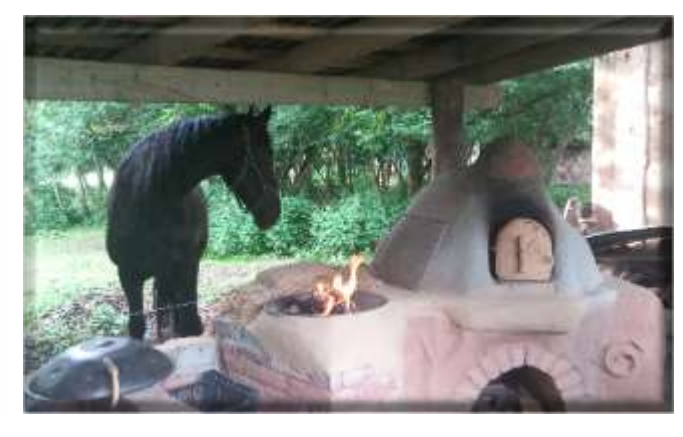
*Outdoor kitchen with friendly company