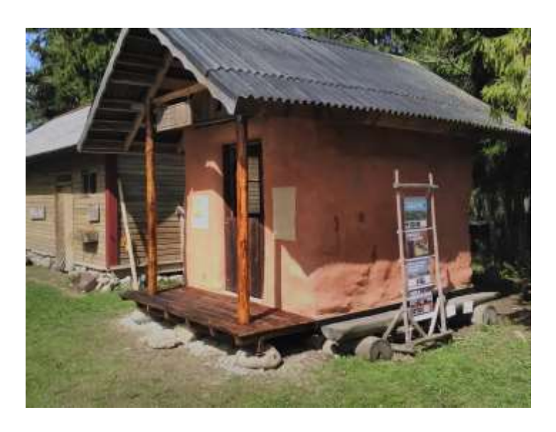
*Small strawbale house and big strawbale house in progress.

There will be a step by step learning of earth plastering. We work with local clay materials, we will render curvy walls and will be modelling relief elements.