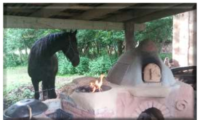
*Outdoor kitchen with friendly company