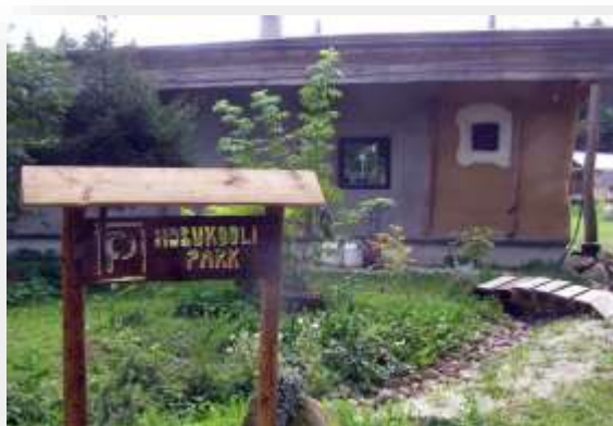
*Strawbale seminar house, 100 m2 of floor area

With last 10 years the area of Hobukooli Park has been slowly growing. The Park has been planned and built according to Permaculture Principles. Today there are 30 hectares of land, private forest routes and big pastures for horses, also several ongoing projects to improve the facilities. All houses are from natural materials, mostly from straw, clay and reused wood. Practical environmental education for pupils, students and teachers has been provided in Park over last 10 years.