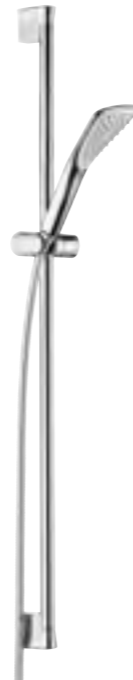
6764005-00 1S shower set L = 900 mm 6774005-00 3S shower set L = 900 mm*