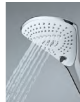
Smooth Line The Smooth Line stream aligns the wide yet gentle jets of water in one row, thus generating a consistent, parallel flow of individual jets.