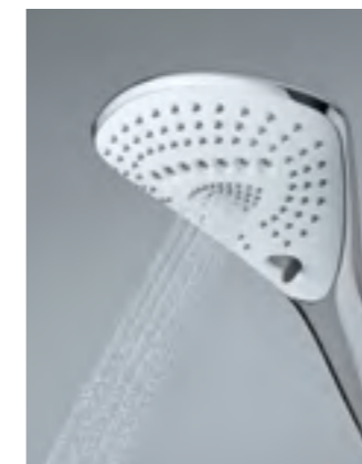
Booster The booster centres the jet in the middle of the shower head, creating an invigorating and massaging stream of water.