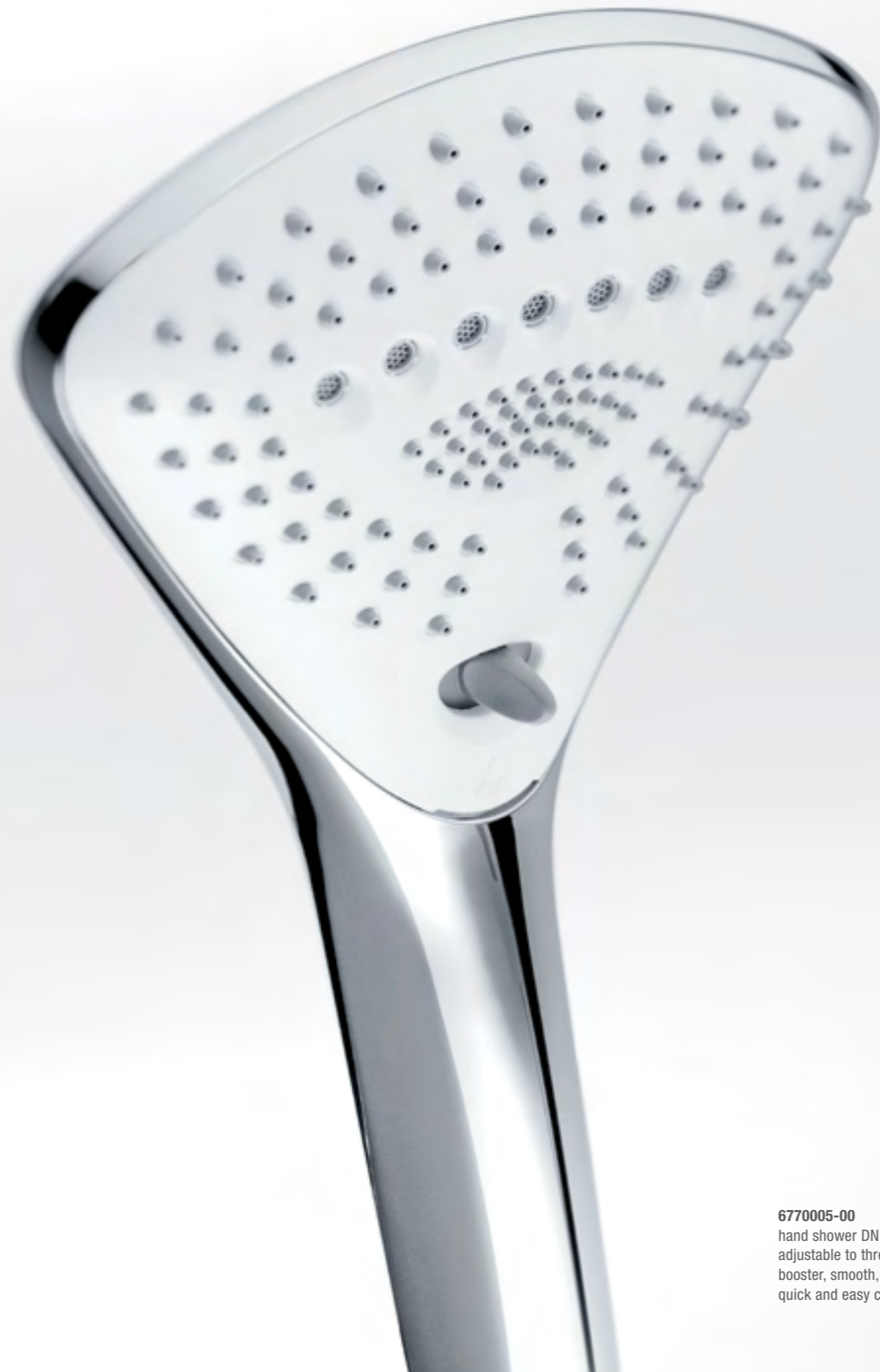
6770005-00 hand shower DN 15 adjustable to three spray patterns: booster, smooth, volume quick and easy cleaning system