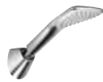
6757005-00 head shower DN 15 wall fastening with adjustable ball joint inclination angle of 36°