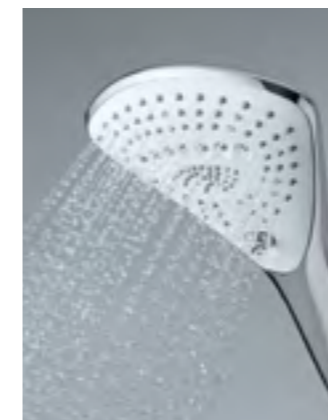
Volume jet The volume jet with 75 nozzles is uniformly wide and soft.