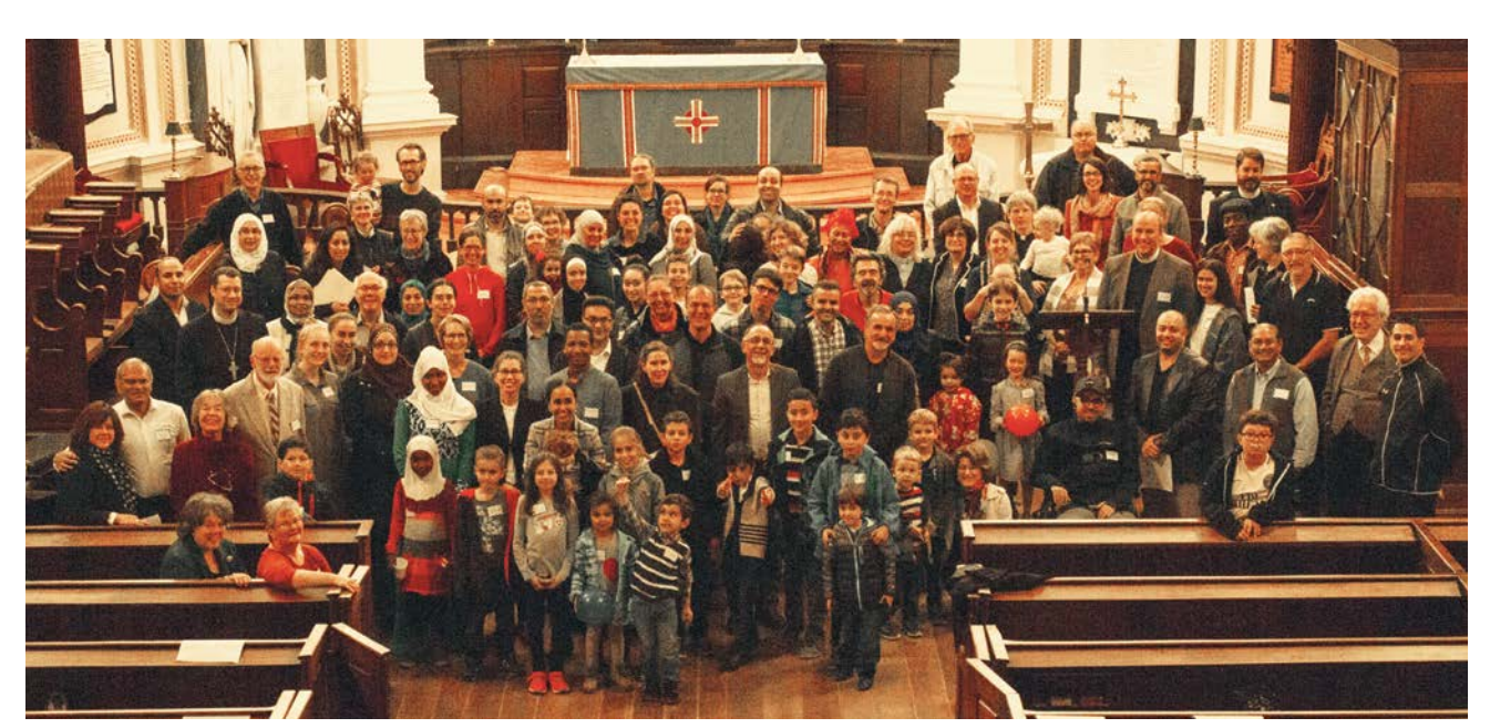
Members of the Islamic Cultural Centre of Quebec City and Holy Trinity Cathedral share fellowship.

already friends. They realized that they had kids in the same school, they had kids in the same classes even.