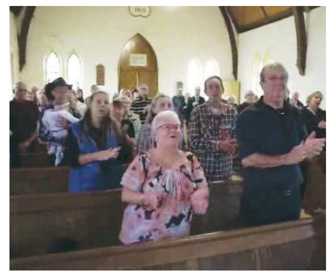
A moment from the Country Gospel Hour

I have a country band that comes to Danville and we work together on choosing songs. At a recent event, we began with "Little Mountain Church House." We played "You Go to Your Church, I'll Go to Mine." It's a very special song, because we have a lot of United people that join us, too. We did "Time Out for Jesus," "Because He