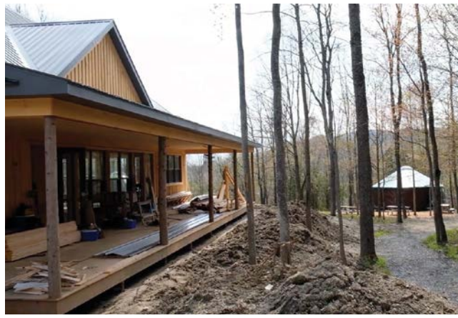
Renovation at Quebec Lodge

for the children of Syrian refugees to go during the summer. It was remarkably difficult to talk to the parents about this, because-well, to put it bluntly-camps had