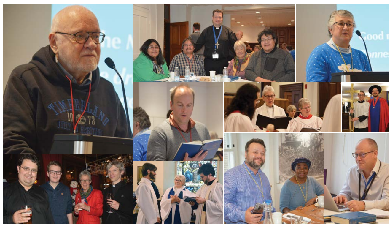
Le synode diocésain a rassemblé des gens de partout dans le diocèse de Québec afin de prendre des décisions, de partager de bonnes nouvelles et de se recueillir ensemble pour chanter les louanges et la gloire de Dieu.