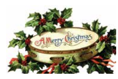
Saturday, December 3rd St. George's, 1002, rue Main Ayer's Cliff

The Church of the Resurrection, in Grand Bay, N.B., was built when a number of parishes in the area amalgam-