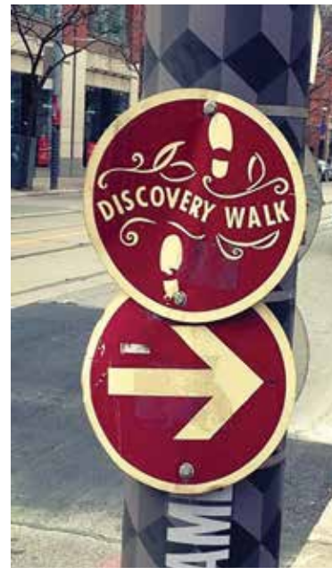
The Diocese of Toronto responds to the word "In- and the word of the day (for vite" in last year's Advent- example, #Shine, #Hope or Word calendar.