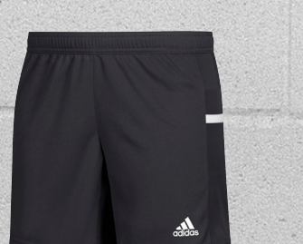
BLACK / WHITE---