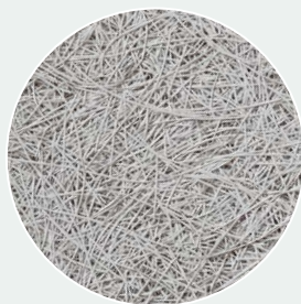
Stone Grey (SG) RAL 7035*