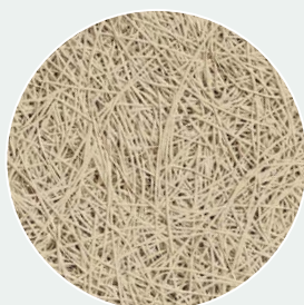
Natural painted (NP) RAL 1015*