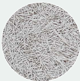
Cloud Grey (CG) RAL 7047*