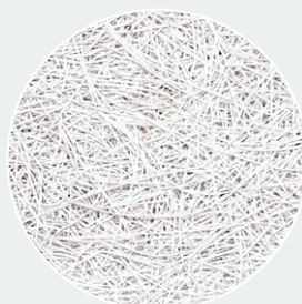
White painted (WP) RAL 9003*