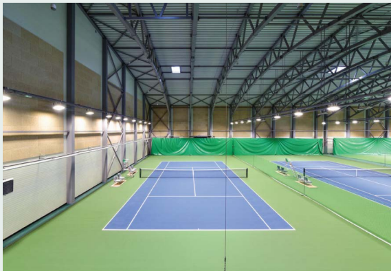
Sample with CEWOOD nonpainted Acoustic panels

When selecting unpainted panels, bear in mind that the tone can differ, and it will allow enjoying natural colour variations of wood, however, if homogeneous tone is important in design, then CEWOOD recommends choosing panels painted in natural colour. The quality of CEWOOD panels in either case is excellent and meets all requirements.