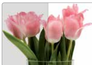
Transparent 6 mm safety glass T1