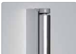
Anodized metallic PrA