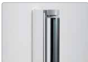
Glanz metallic PrG