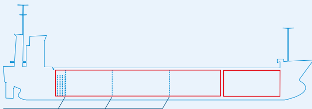
3 removable bulkheads