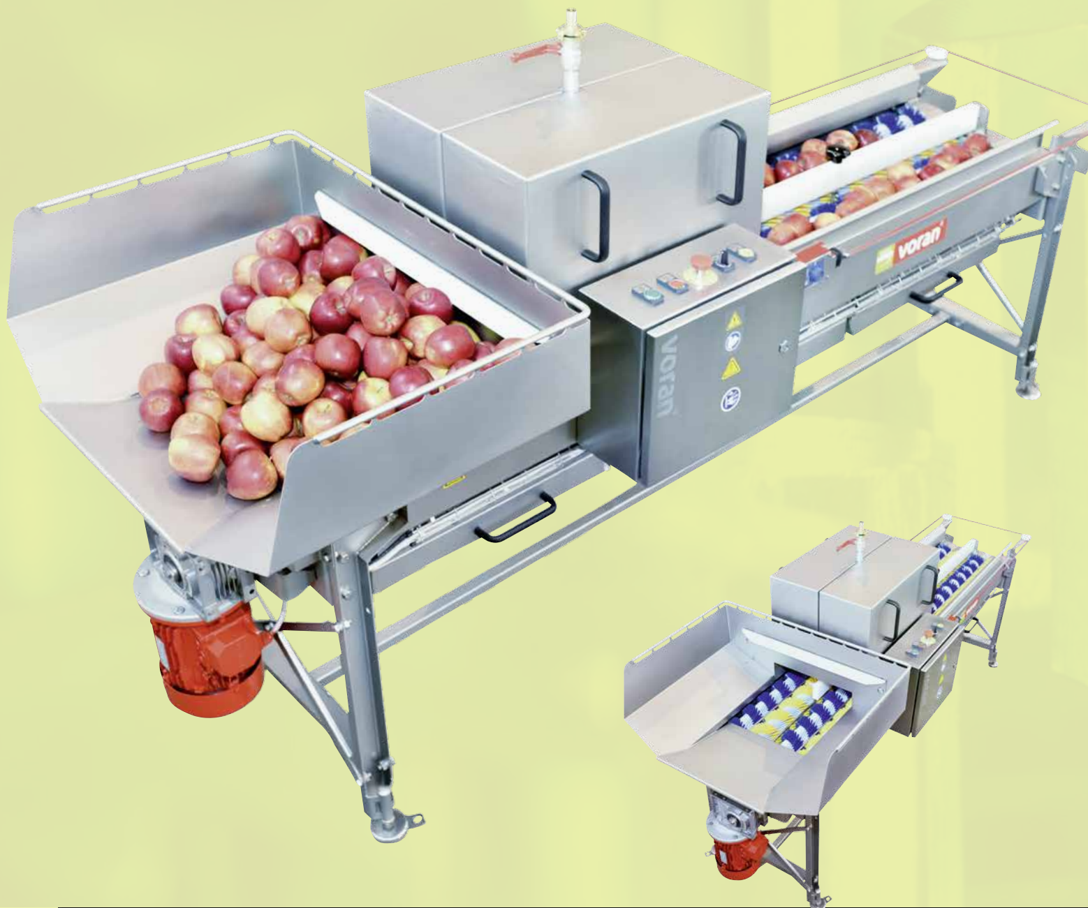
Brush cleaning table BRM2000

An additional third brush is also provided at the brush starting area, which also brushes the fruit from above and serves as a counter-holder. The integrated water sprinkler wets the fruit from all sides, which increases the cleaning effect.