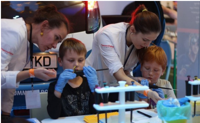
Science Centre AHHA

This year's Researchers' Night Festival in Estonia was bigger and better than ever, spreading to every corner of the country and offering over 400 fun science events throughout one week. However, the most exciting part of the festival was definitely the Tartu Mini Maker Faire, the first one ever held in the Baltic States .