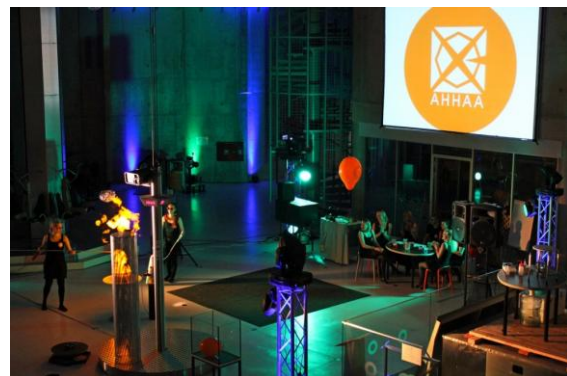
The way we are