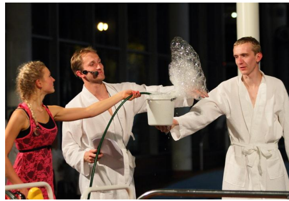
The Science Show

It all comes down to basics - what interests people, what makes them to come to visit a science centre and how to manage with limited sources? Come and discuss your ideas and experiences with international colleagues in beautiful Tartu city in 19-21. September!