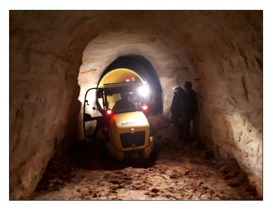
Photo 3. Pulling and pushing culvert elements with two small size four wheel loadres inside of the cave tunnel.