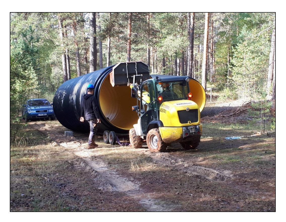
Photo 2. Preparation of pulling-pushing culvert elements with two small size four wheel loadres outside of the cave tunnel.