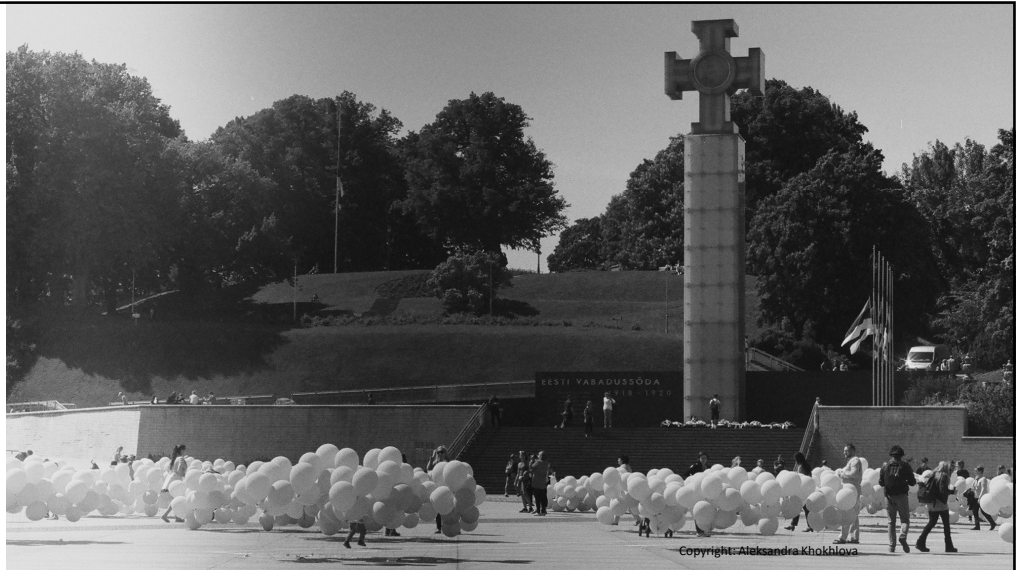
Photograph 5: Tallinn, 2017

The same commemoration event as the girl is observing. Picture is taken with a Soviet camera Zenit. The picture emphasizes the subtle commemoration event, in a striking public space (the freedom square)