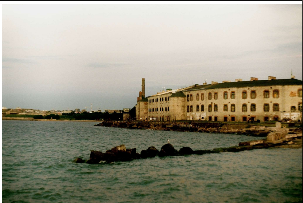
Photograph 2: Tallinn 2017 A view onto the Peter's maritime fort. A fortress of Imperial Russia that for a long time held also political prisoners.