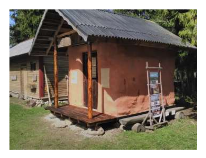
*Small strawbale house and big strawbale house in progress.

There will be a step by step learning of earth plastering. We work with local clay materials, we will render curvy walls and will be modelling relief elements.