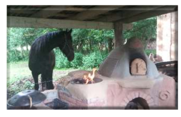
*Outdoor kitchen with friendly company