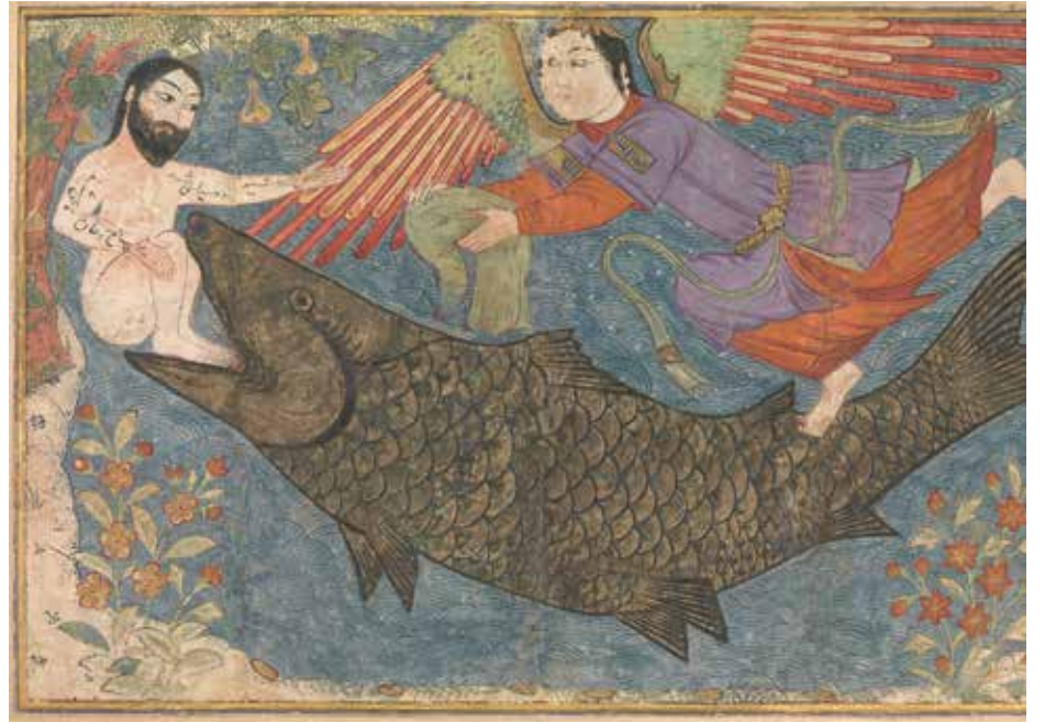
"Jonah and the Whale", Folio from a Jami al-Tavarikh (Compendium of Chronicles) ca.1400, The Metropolitan Museum of Art.

In addition to all the threats of vengeance, God also tells the Israelites to abandon Jerusalem and go and submit to the king of Babylon – the arch-pagan, the heretic, the apostate, the Other. Perhaps that's why the Israelites thought Jeremiah was full of baloney. It couldn't be their God telling them to do that! Or perhaps God was saying, this religion of fear and vengeance has become twisted, like Ahab's in Moby Dick , like the priest's in Notre Dame . Let's get right away and start again somewhere different, among strangers.