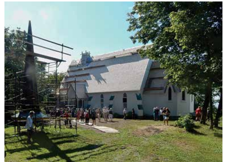
Some of those gathering for one of the three summer concerts. The unrestored bell tower can clearly be seen awaiting its restoration.

At the annual Vestry Meeting held in August 2016, a fundraising committee was established to match the funds the CPRQ would commit to the refurbishing of both the church and the parsonage, located next door. The parsonage has been used