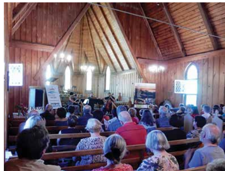
Many come from far and wide for the concerts

neering, architectural, and code studies were completed and in early 2018, a contract was signed for the first phase of the restoration project: replacing the St. James roof in a style that replicated the original roof: cedar shingles. The work was initiated in May and is scheduled to be complete by the end of August. An outstanding effort by the entire congregation appears to have strengthened the bonds of this small summer parish.