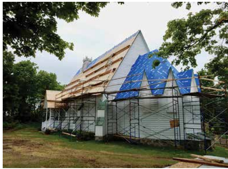
The new cedar roof goes on. The bell tower was rotting so it was removed by a crane and will be rebuilt on the ground to be then placed back on the church.