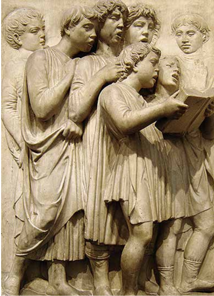
Luca della Robbia's Cantoria, ca. 1435, Museo dell'Opera del Duomo, Florence.