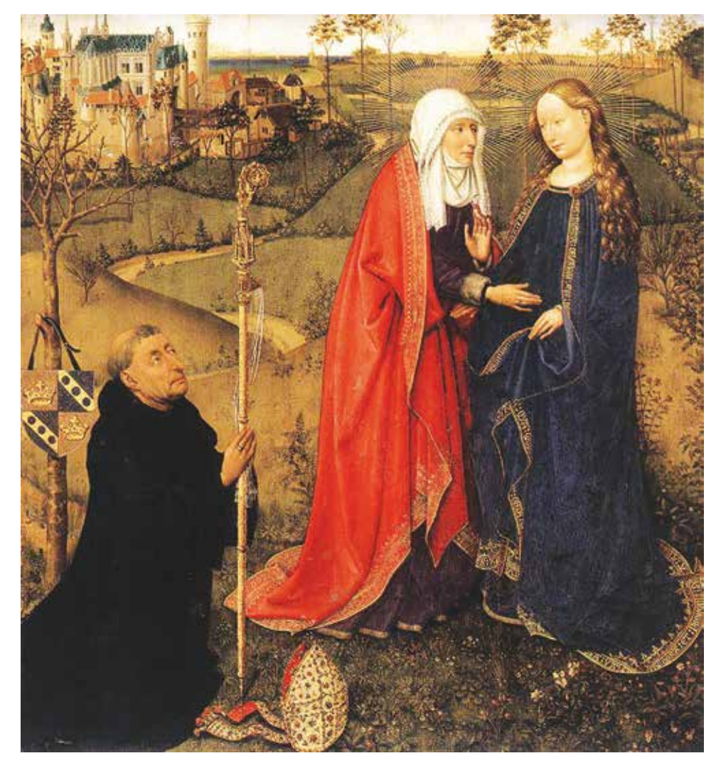
"Visitation", from Altarpiece of the Virgin by Jacques Daret, c. 1435 (Staatliche Museen, Berlin).

I thought it couldn't get much worse until one night we were praying for a friend's mother who was dying a painfully long drawn-out death, and I