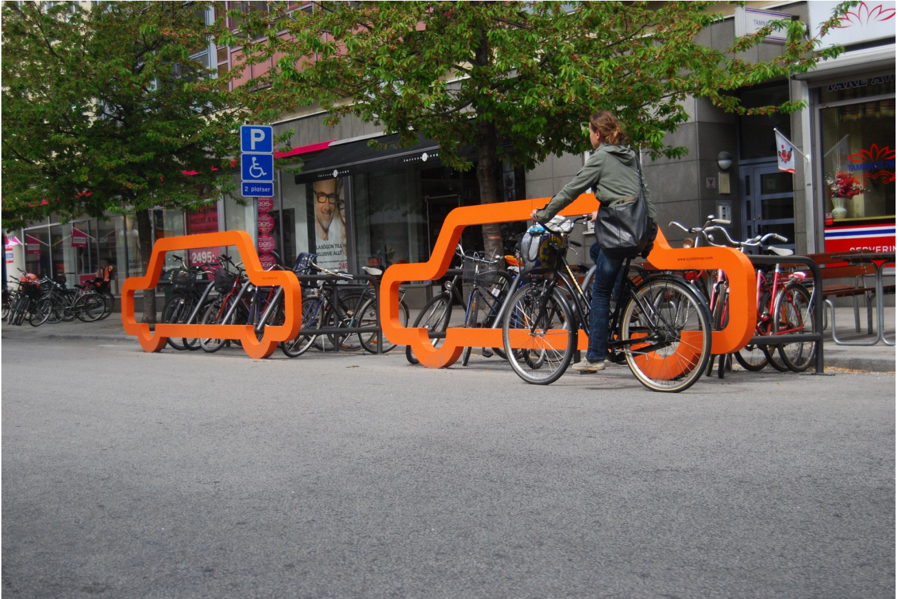
Figure 5 cxi