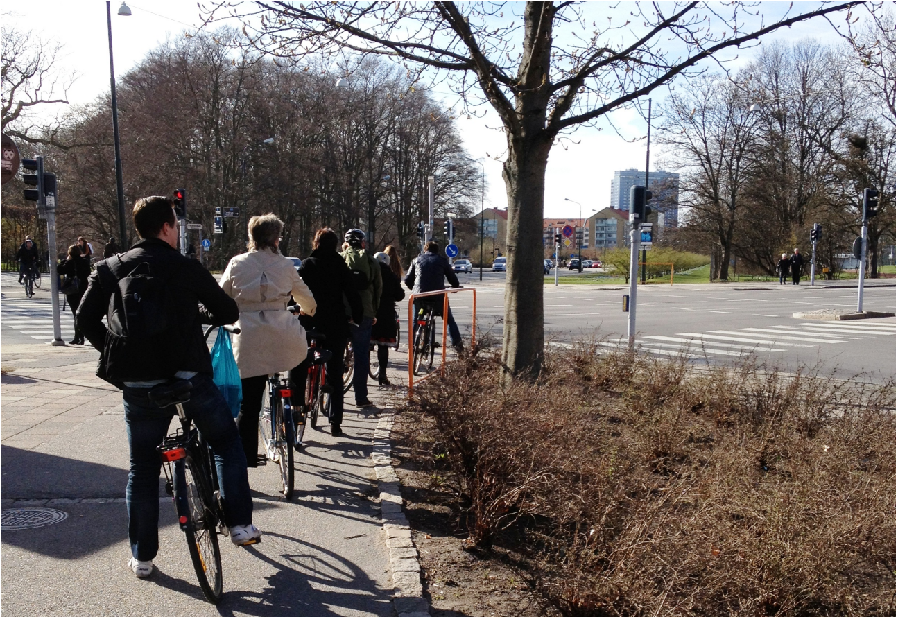
Figure 8 cxiv