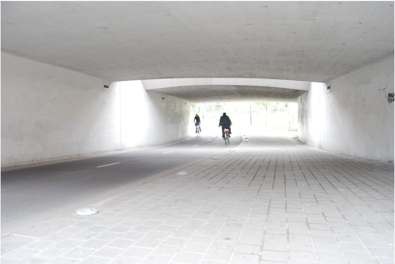
Figure 6 cxii