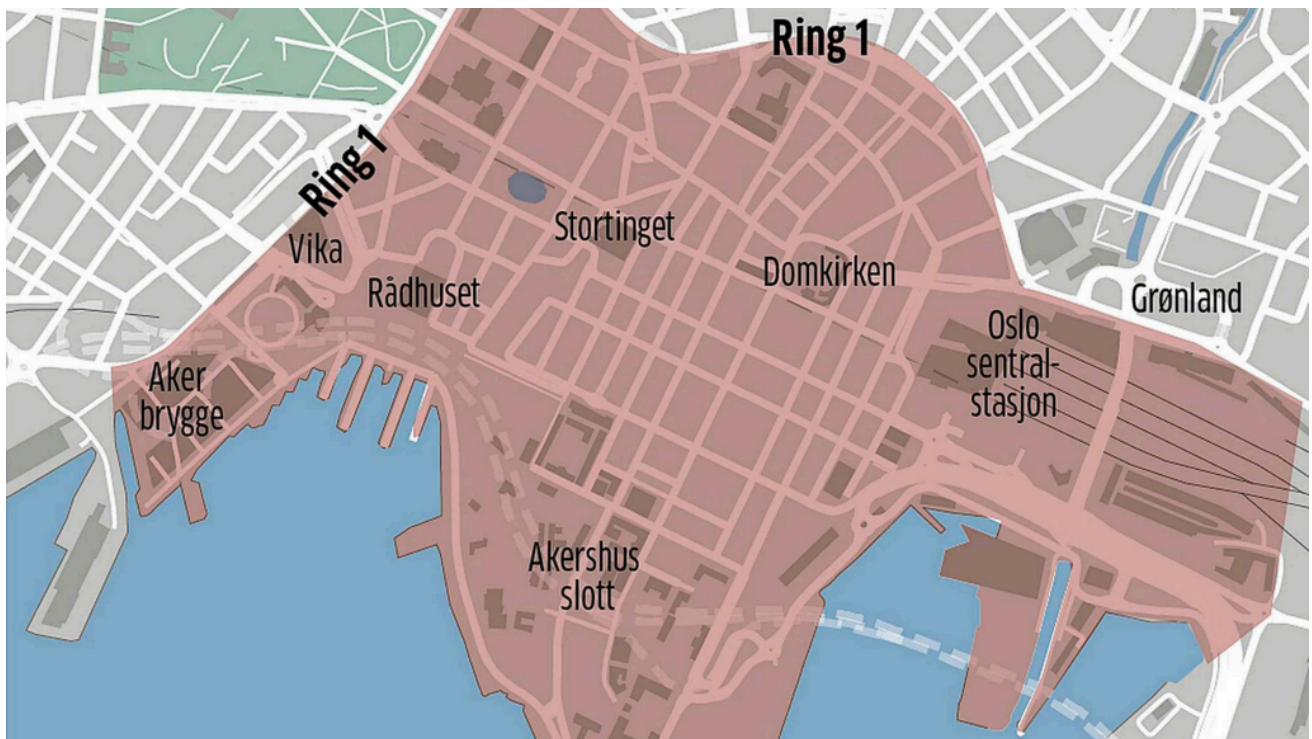
Figure 3 lxxv

One good and quite universal question the ensued debate has raised is this – will a city lose its uniqueness when it does away with cars or limits them? lxxiv This was asked in Oslo and it can certainly be asked elsewhere. Why should there be fewer customers when there is more space for them to stroll, sit, chat, spend time with friends or family, “windowshop”, walk their dogs, have lunch or coffee? They will fill the place that has now been opened and freed for them – keywords quality policies, stakeholder consultation, planning, construction and communication. The audience will be there. It is up to the stakeholders to help steer which the audience will be and the marketers to place their products properly.