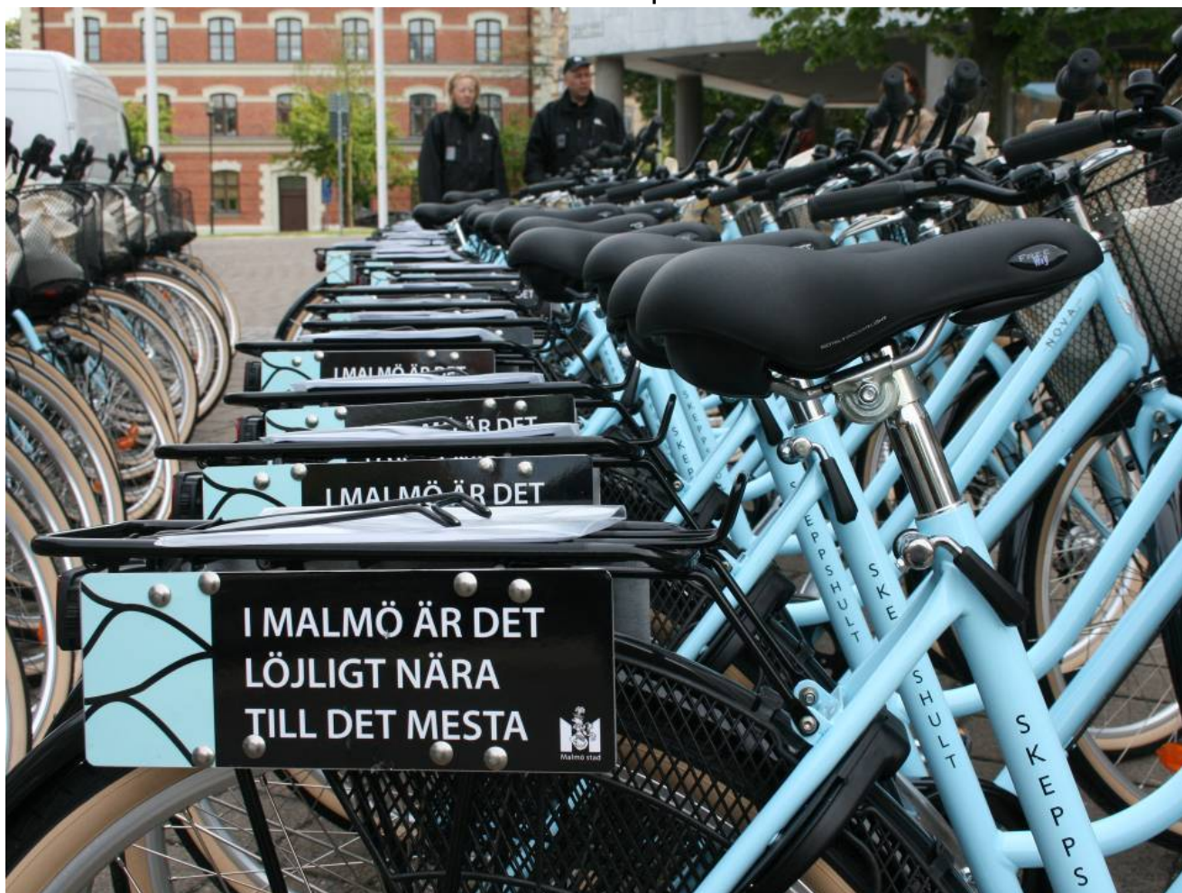
Figure 4 cx

Friendly Roads to School focused on parents and children cycling to school. There are obvious health benefits for everybody, not to mention security improvements that a smaller volume of cars on a less nervous peak hour entails. There are children's events (Bikesafari) and kindergarten use bicycles to drive children around.