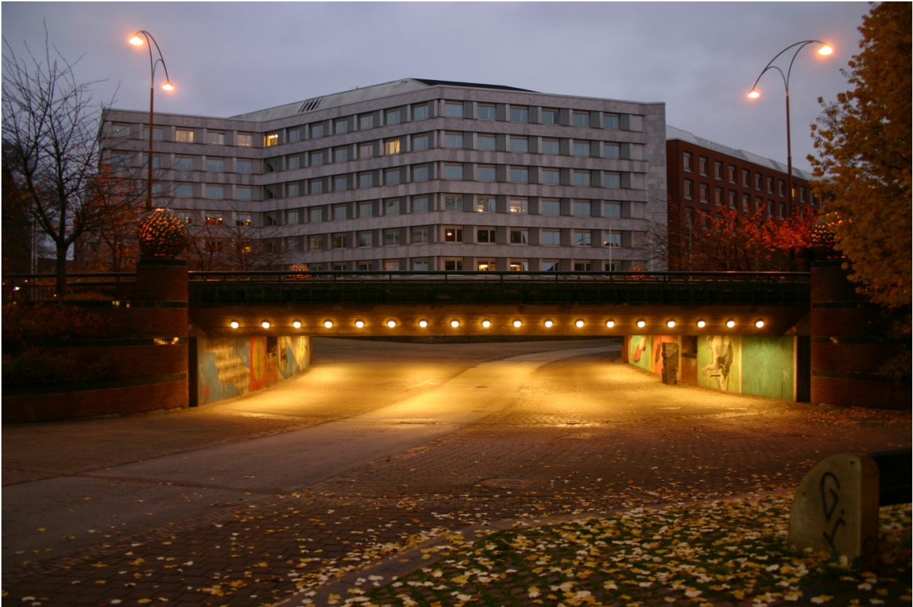
Figure 7 cxiii