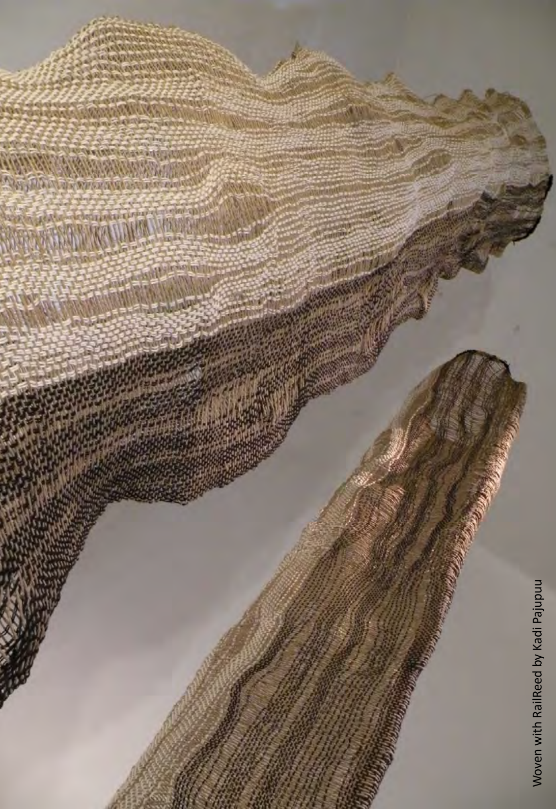
Woven with RailReed by Kadi Pajupuu