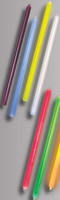
2 End Rings Impact