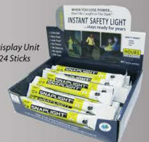
Counter Display Unit (CDU) for 24 Sticks