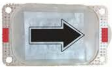
Custom Printing Available