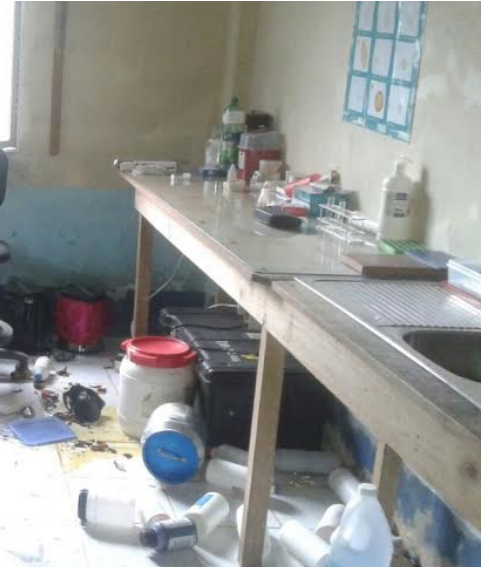
Below: The state of the only road from the outside world to La Y