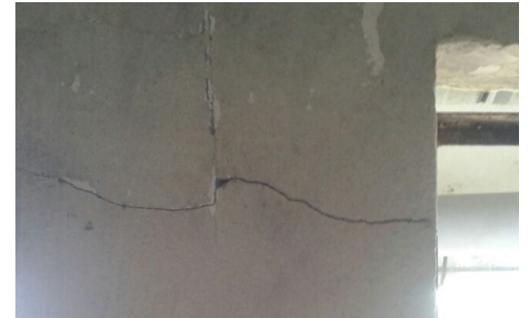
Cracks in a wall of the health center. Sadly, the entire building looks like this.

Parts of the road from the district capital Quinindé to La Y got destroyed making people's transportation difficult and dangerous, and impeding the haulage of goods