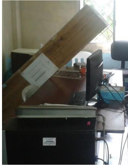
Above: The health center laboratory