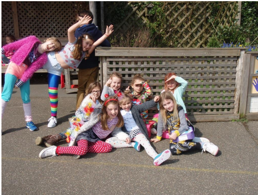
Having fun on Red Nose day