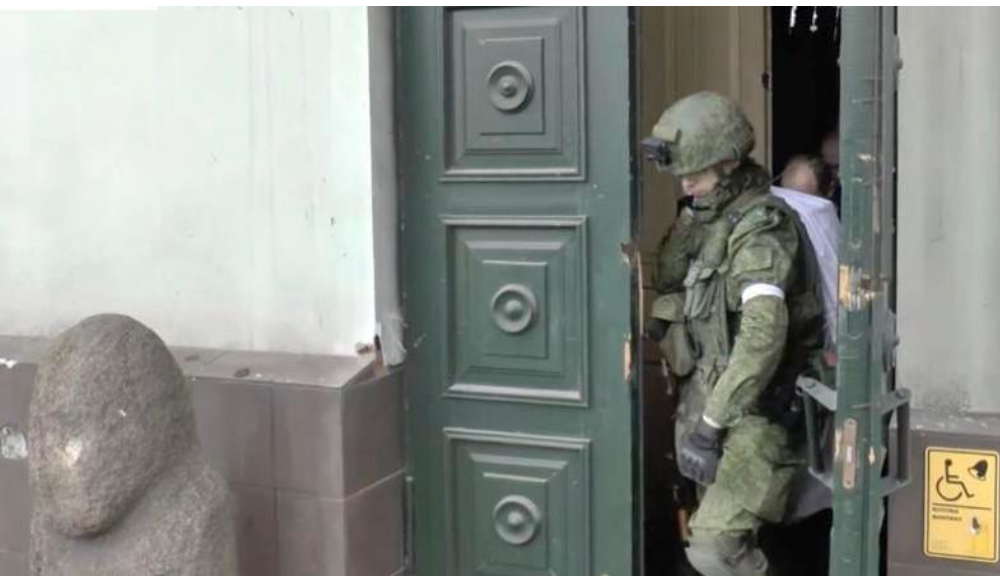
Mariupol. Donetsk region