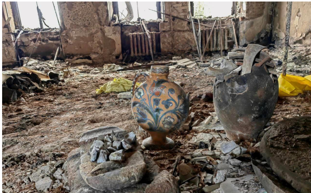
Mariupol Museum of Local Lore, Donetsk region