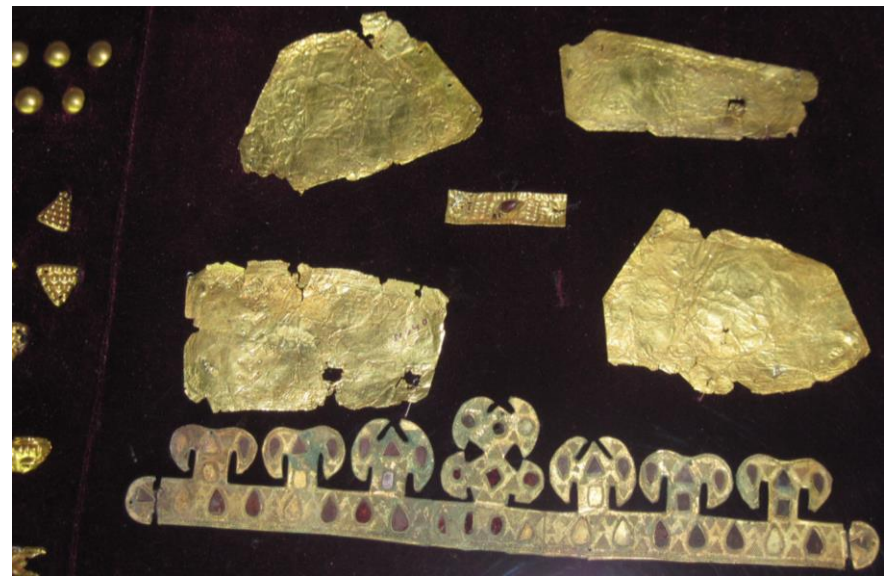
Melitopol, Zaporizhzhia region