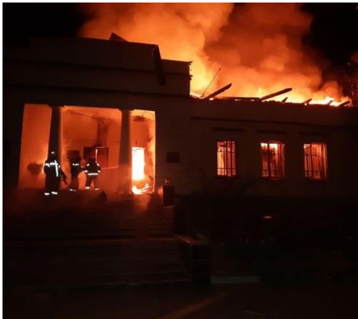
Hryhoriy Skovoroda Museum, Skovorodnyvka, Kharkiv region