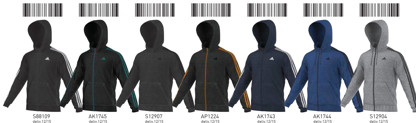
S88109 deliv.12/15 AK1745 deliv.12/15 S12907 deliv.12/15 AP1224 deliv.12/15 AK1743 deliv.12/15 AK1744 deliv.12/15 S12904 deliv.12/15