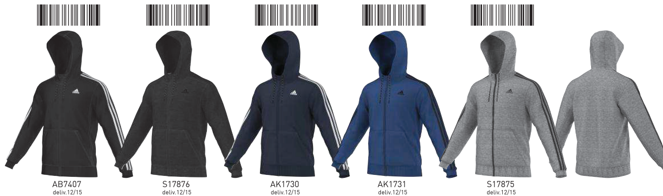
AB7407 deliv.12/15 S17876 deliv.12/15 AK1730 deliv.12/15 AK1731 deliv.12/15 S17875 deliv.12/15