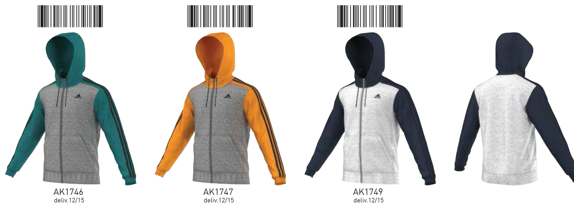
AK1746 deliv.12/15 AK1747 deliv.12/15 AK1749 deliv.12/15