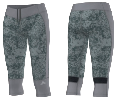
AA2342 deliv.06/15 re-order