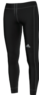
AA0527 deliv.06/15 re-order