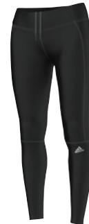
AA0617 deliv.06/15 re-order