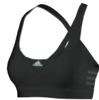
S90389 deliv.06/15 re-order