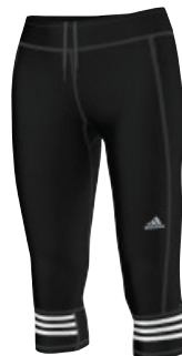
AA5660 deliv.06/15 re-order