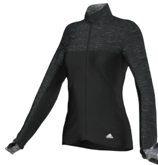
AA5547 deliv.06/15 re-order