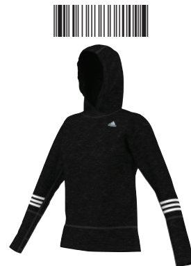
AA0660 deliv.06/15 re-order