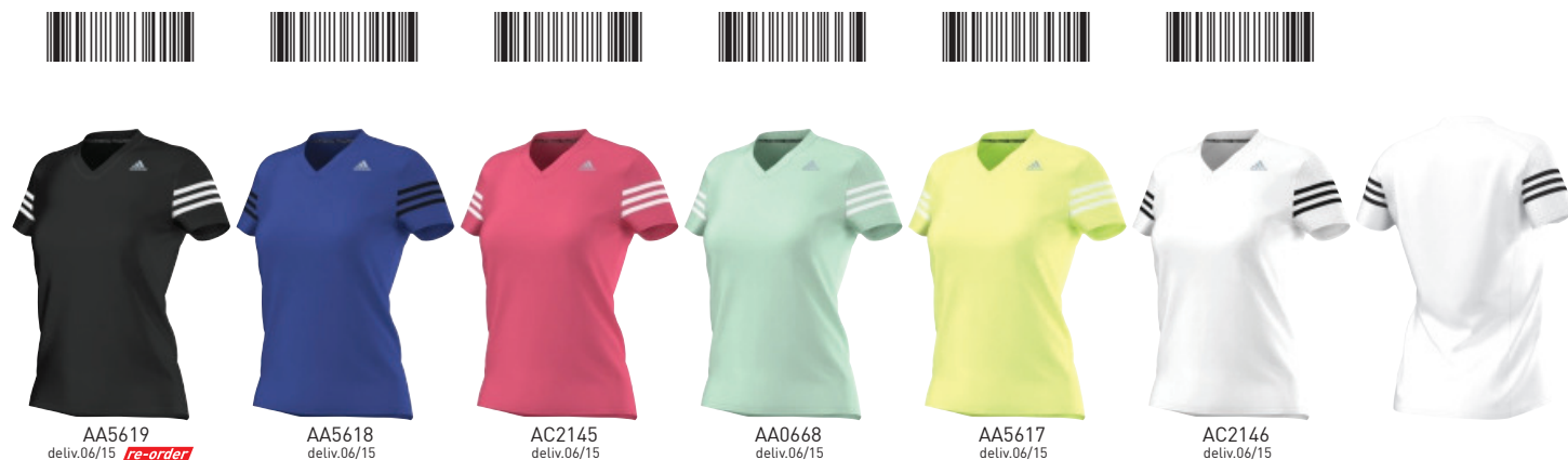
AA5619 deliv.06/15 re-order