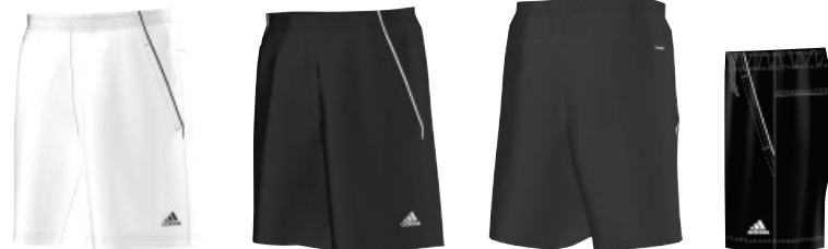
004786 deliv.06/15 re-order