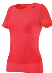
S94407 deliv.06/16 re

enhanced FORMOTION® REGULAR FIT climalite