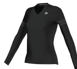
AX6553 deliv.06/16 re