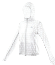
AP8439 deliv.07/16 re