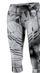
AP9740 deliv.09/16 re