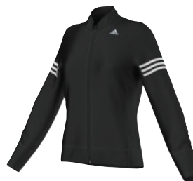
AA5639 deliv.06/16 re