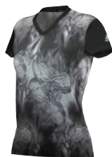
AX6000 deliv.06/16 re