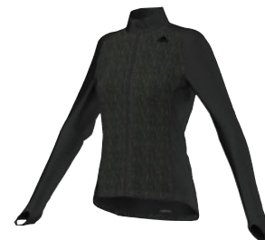
AX7460 deliv.06/16 re