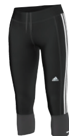
AX6595 deliv.06/16 re