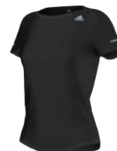
S02987 deliv.06/16 re