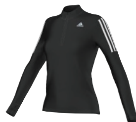
AX6592 deliv.06/16 re