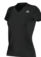
AX6577 deliv.06/16 re