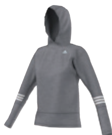
AI8278 deliv.06/16 re