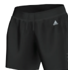
AY1563 deliv.06/16 re