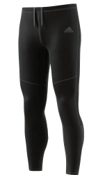
B47717 deliv. 01/17