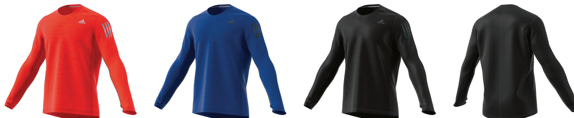
BP7485 deliv. 01/17 BP7491 deliv. 01/17 BP7482 deliv. 01/17

50% rec.Polyester/50% Polyester, doubleknit, 123g • CLIMALITE Stay dry, stay comfortable. climalite® keeps your body dry by drawing sweat away from the skin. • REFLECTIVE STRIPES So you want to run in the dark. Work goes late and you just can't get out for your daily 5km before the sun goes down. You need to be seen with reflective stripes