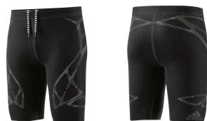
S99691 deliv. 01/17