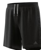
S94400 deliv. 12/16