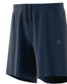
B47724 deliv. 01/17