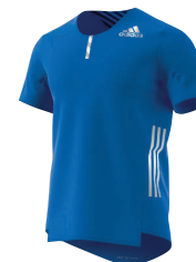
S99685 deliv. 01/17