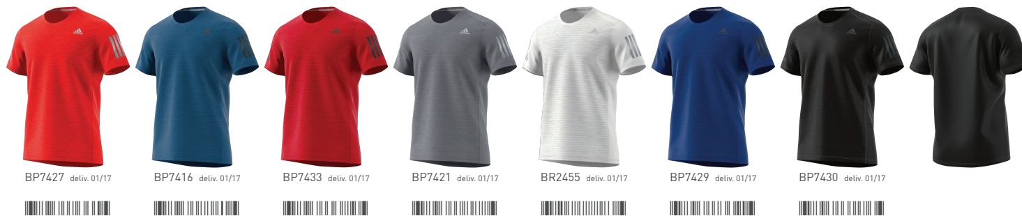
BP7427 deliv. 01/17 BP7416 deliv. 01/17 BP7433 deliv. 01/17 BP7421 deliv. 01/17 BR2455 deliv. 01/17 BP7429 deliv. 01/17 BP7430 deliv. 01/17

50% rec.Polyester/50% Polyester, doubleknit, 123g • CLIMALITE Stay dry, stay comfortable. climalite® keeps your body dry by drawing sweat away from the skin. • REFLECTIVE STRIPES So you want to run in the dark. Work goes late and you just can't get out for your daily 5km before the sun goes down. You need to be seen with reflective stripes