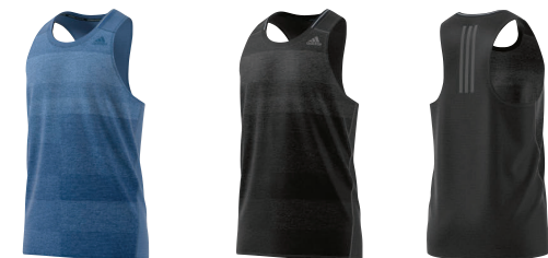
S97984 deliv. 12/16