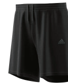
BJ9339 deliv. 01/17