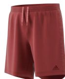
S97998 deliv. 12/16