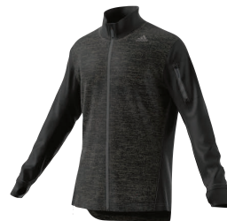
S94396 deliv. 12/16