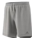
S97999 deliv. 12/16