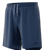
S97997 deliv. 12/16