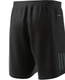
BJ9339 deliv. 01/17