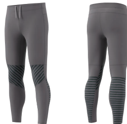
B28231 deliv. 12/16