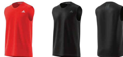
BP7410 deliv. 01/17