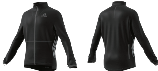
S99687 deliv. 01/17