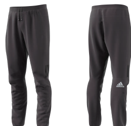
S99696 deliv. 01/17