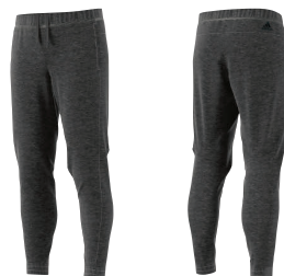
AZ2909 deliv. 12/16