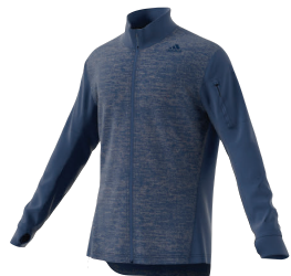
S97995 deliv. 12/16