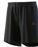
BR2551 deliv. 01/17