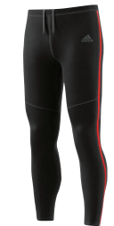
B47715 deliv. 01/17