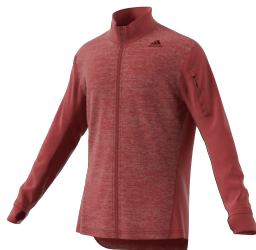
S97994 deliv. 12/16