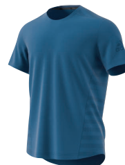
BQ2196 deliv. 12/16