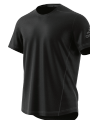
BQ2193 deliv. 12/16