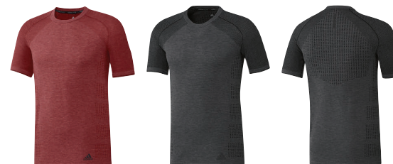
AZ2882 deliv. 12/16