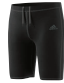
B47723 deliv. 01/17

83% Polyester/17% Elasthane, doubleknit, 160g