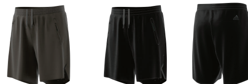
AZ2889 deliv. 12/16