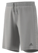
AZ2994 deliv. 12/16