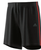
BR2452 deliv. 01/17