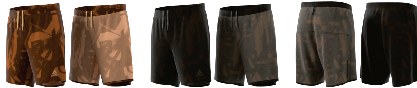
B28235 deliv. 12/16