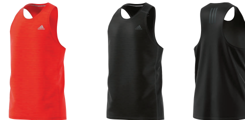
BP7473 deliv. 01/17