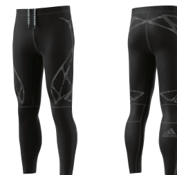
S99705 deliv. 01/17