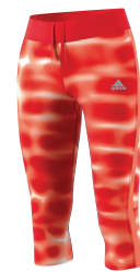
AZ7334 deliv. 01/17