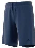
AZ2995 deliv. 12/16