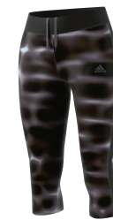
BK0435 deliv. 01/17