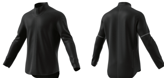
BK7357 deliv. 12/16