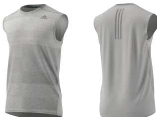
S97989 deliv. 12/16