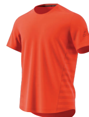
B28243 deliv. 12/16