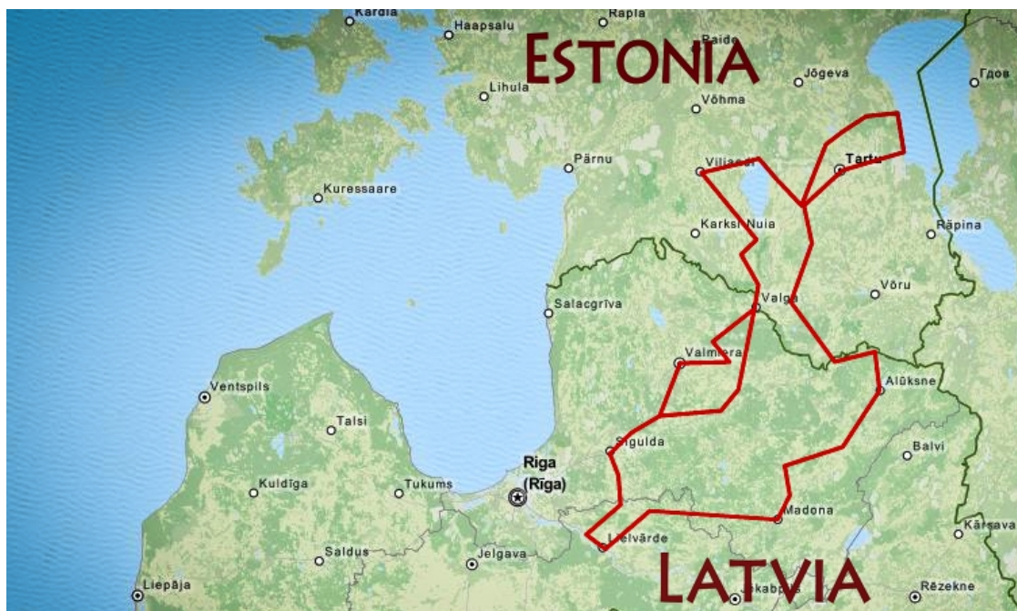
Cross-border cycling route Tour de LatEst.

Partnership: Amata Municipality Council (LV), Ape Regional Council (LV), Gulbene Municipality Council (LV), Latvian Tourism Development Agency (LV), Madona Regional Council (LV), Mālpils Regional Council Ogre Regional Council (LV), Sigulda Regional Council (LV), Valga County Government (EE), Valka Municipality (LV).