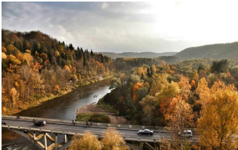
River Gauja near Sigulda, Latvia.

Description: The river basin district Gauja/Koiva is transboundary, shared between two countries - Estonia and Latvia. Even though a majority of the basin lies in Latvia, the waters from Latvia flow into Gulf of Riga, which also is shared by both countries. Due to stream directions, the waters from Latvia are brought to Estonian coasts before the