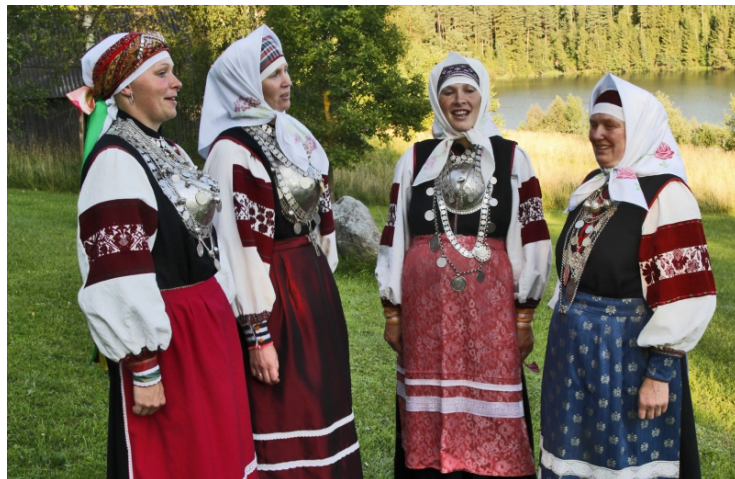
Seto women in traditional costumes.

However, the regions and communities are still not making full use of the potential of existing natural and cultural resources and of the fact that the common cultural and natural space does not end with the borders of a county, region or member state. The sites are often situated in