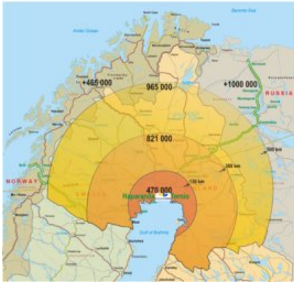
Bothnian Arc map

Although operating within a rather well-established setting and regime of European cross-border co-operation, the interest in projecting oneself as a twin city as well as the symmetries, competence, interests, problems and relevant infrastructures of the cities taking part vary considerably. They seem, in fact, to represent rather diverse patterns of co-operation. In some cases similarity is indeed present and the conceptual umbrella of twinning has really developed into an asset – as in the case of Tornio and Haparanda, two cities connected across the Finnish-Swedish border by a bridge. They are