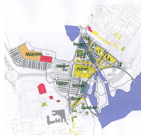
EuroCity shopping centre

It should be noted, however, that some broader developments have in the first place facilitated a lowering of the border. In fact, the border has not been much of an obstacle since the 1960's owing to intense Nordic cooperation. It has been quite easy for Nordic citizens to transgress, and with Finland and Sweden joining the EU in 1995 the border became almost invisible. EU-membership has further spurred cooperation by labelling various endeavours as European rather than local. Likewise, increased EU financial means have been available to promote twinning.