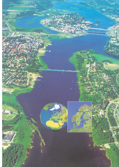
Tornio-Haparanda (aerial photo)

Similarly, the exploitation of vicinity and borders as a resource is not a new phenomenon in the case of Tornio-Haparanda. Their northern peripherality has according to Riitta Kosonen and K Loikkanen (2008) been conducive to a “need to unite”, this then pointing to a distinct and city-related driving logic. Being divided only by a stretch of wetland, and with a tradition of many informal contacts on the level of the inhabitants reaching far back in history, the two cities started formal cooperation already in the 1960's through the common use of a swimming pool (Jussila, 1997: 58). A bilingual paper, Kranni (Neighbour), saw the light of the day and was distributed to all households with information on common development in both towns several times a year (Brańka, 2009: 191). Since then inter-