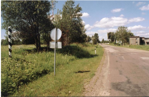
Border between Valga and Valka

The Estonian town of Valga (situated in Southern Estonia; 15.300 inhabitants) and the Latvian one of Valka (located in Northern Latvia; 7.100 inhabitants) joined the chain of twin cities in April 2005 through an agreement to launch a project called “Valga-Valka: One City – Two States”. The word ‘joining’ is justified in this context also because their cooperation with Tornio-Haparanda contributed to the usage and spreading