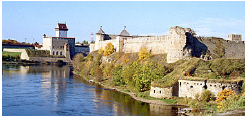
Narva and Ivangorod fortresses

Among the various paired cities, Narva and Ivangorod have either been part of a joint configuration or have stood opposite to each other. Their histories as border-related sites where a major connective route has crossed a river tend to be complex as well as tragic. They experienced periods of rule by Denmark, Livonia, Russia, Sweden and again