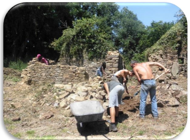
Conservation of the former weaver village of Keranflec'h, in Saint-Thégonnec (2015)