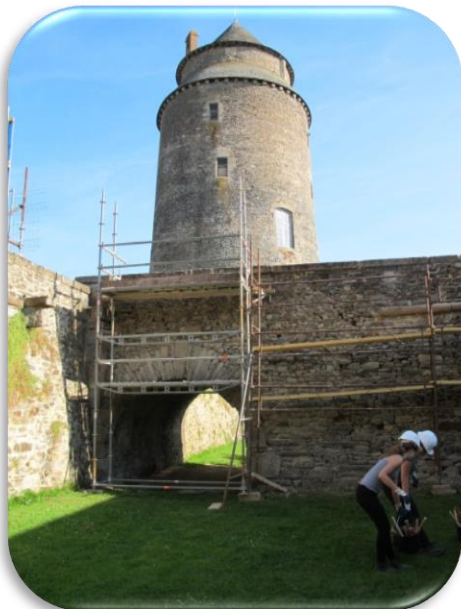
Restoring the moats of Châteaugiron castle (2015)